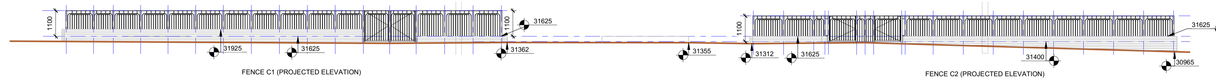
2 Crogsland Road Balustrade - Elevation 1 : 100