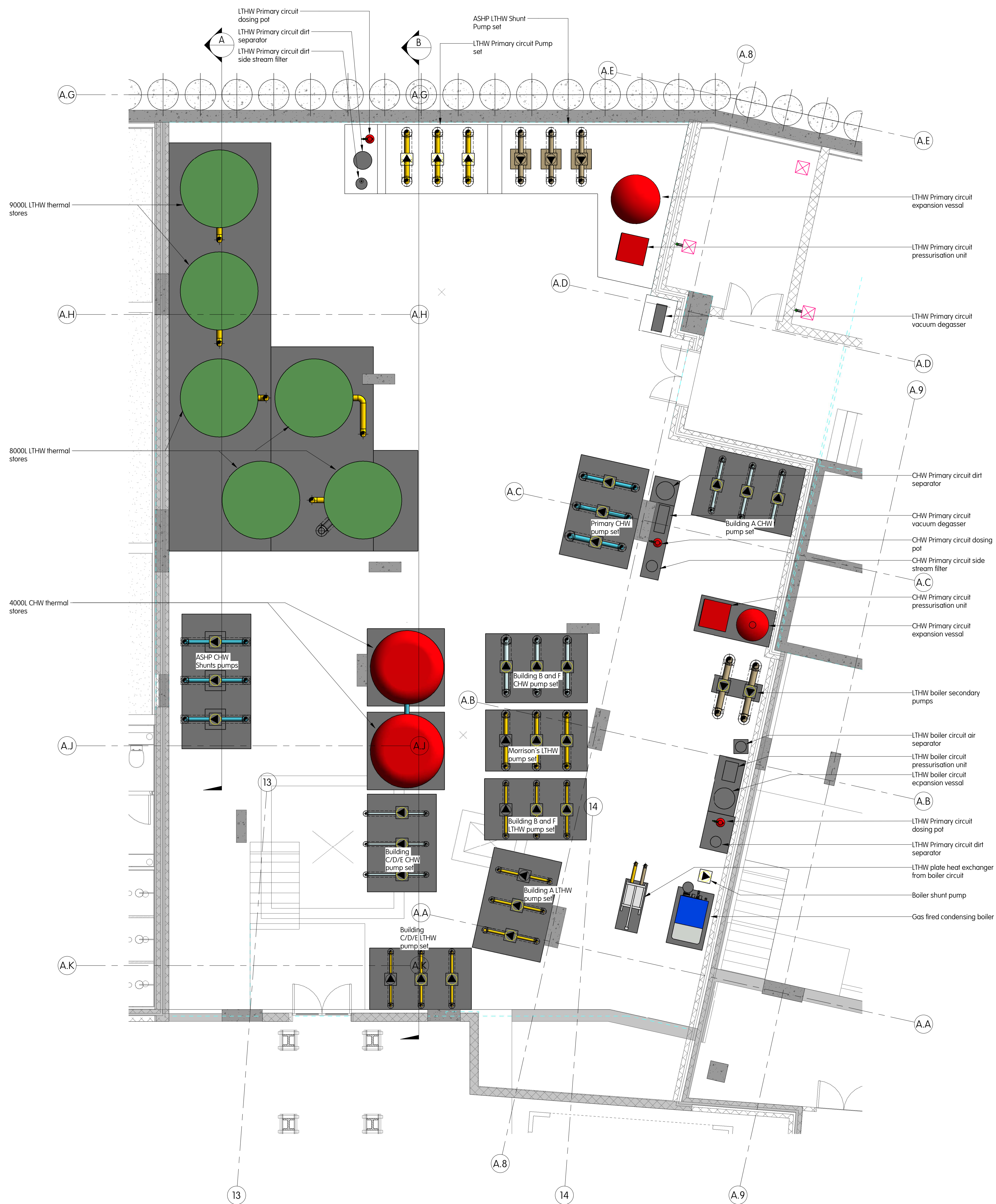
Energy Centre - Low Level 1:50