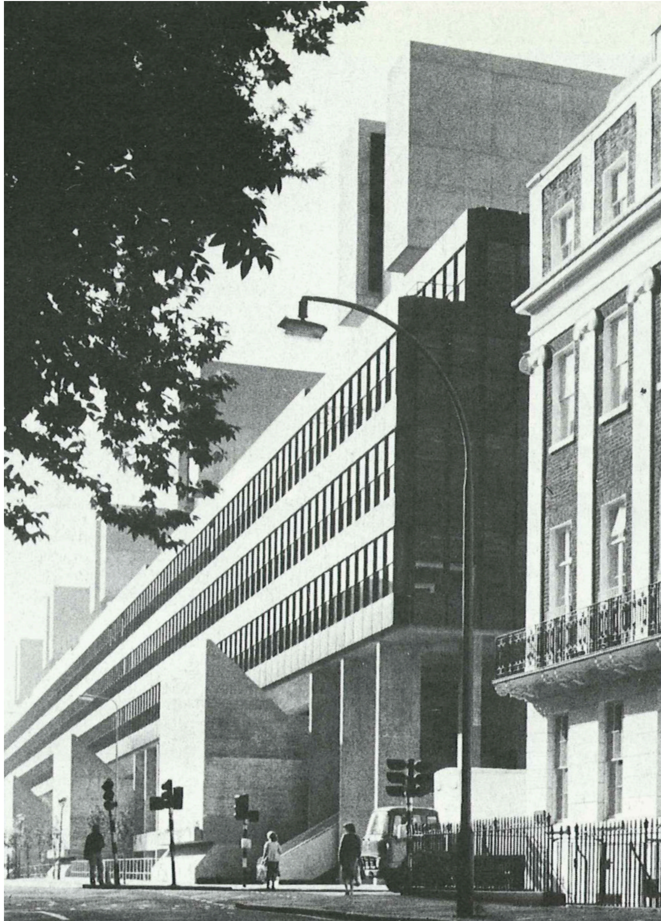
Historical photograph of 20 Bedford Way