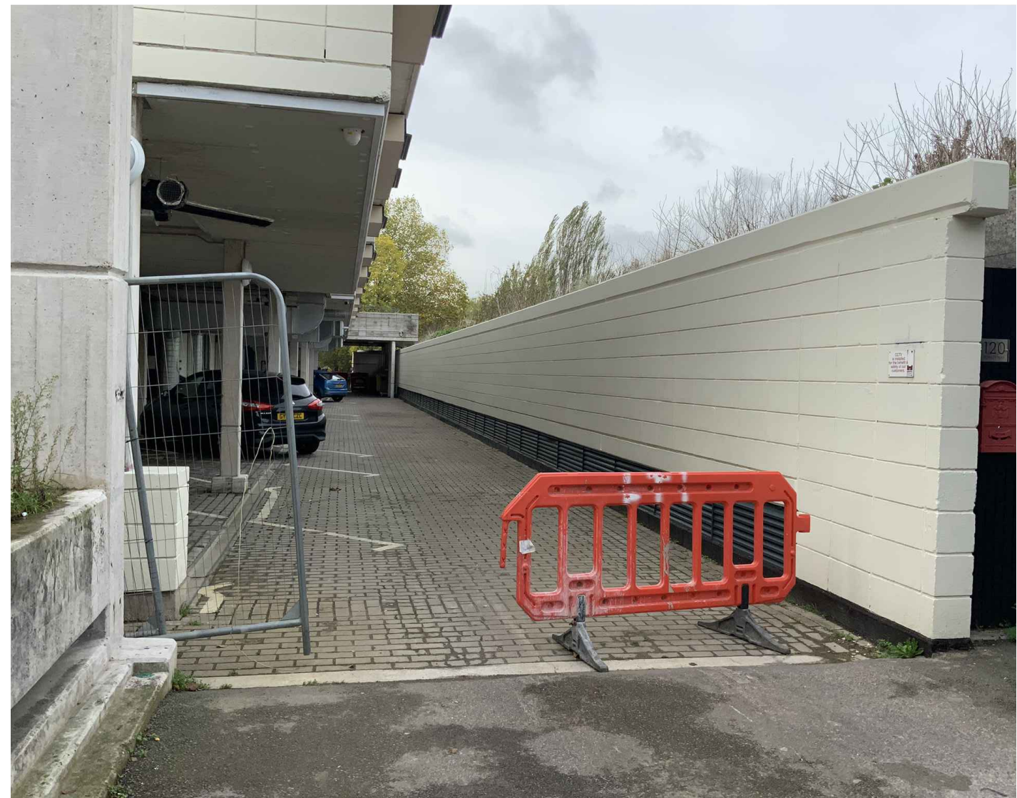
Existing rear access point, from Rowley Way