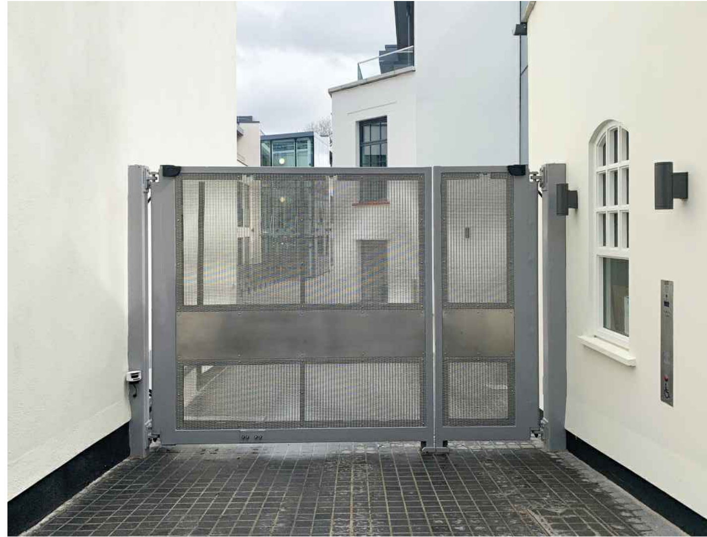
Precedent Image for reference only