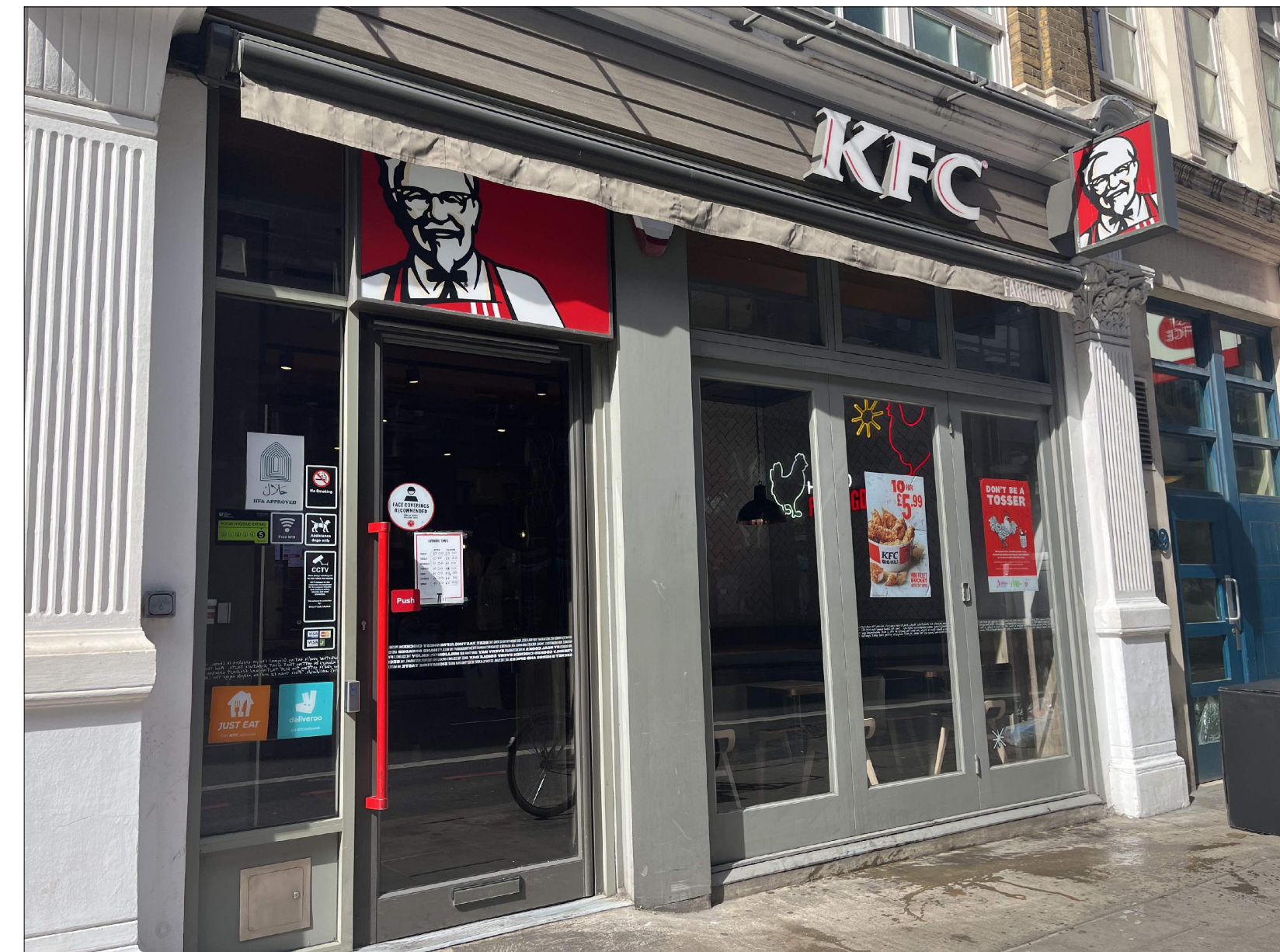
02 EXISTING SHOPFRONT PHOTO NTS