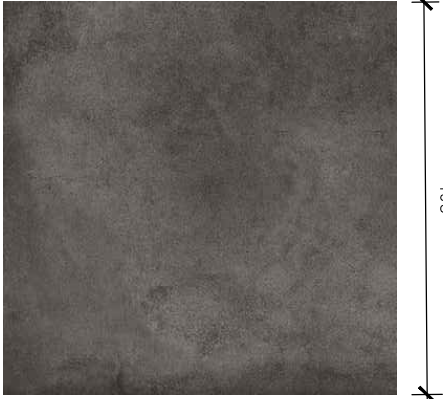
B. Cotto Tech 20mm - Outdoor Porcelain Tiles by Domus