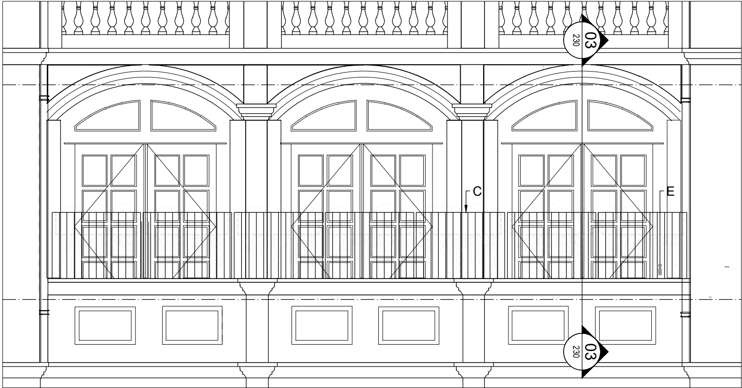
02/230 - Proposed Terrace Elevation