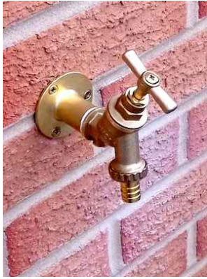
A. Anti-frost External Tap