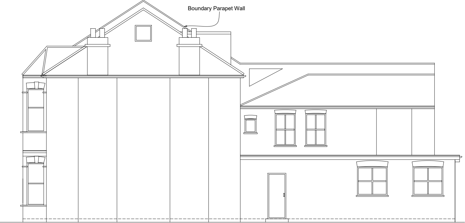
PROPOSED LEFT SIDE ELEVATION 1:100