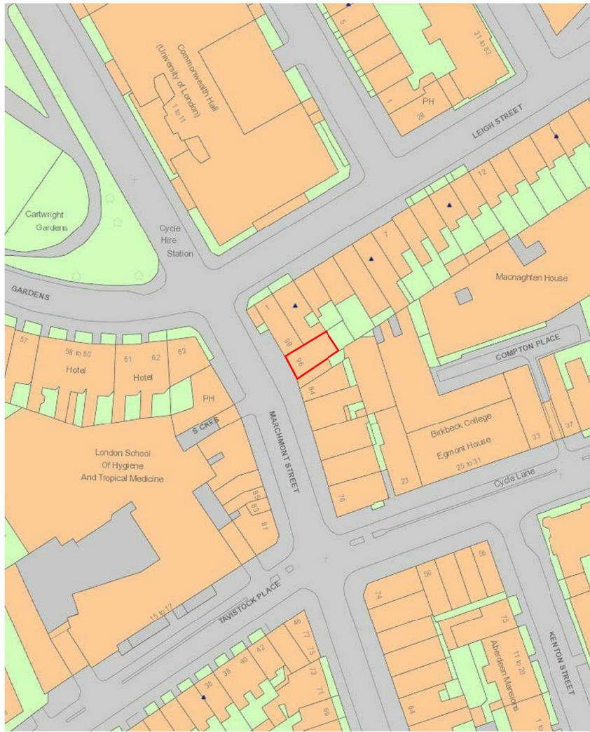
LOCATION PLAN 1 : 1250 @A3