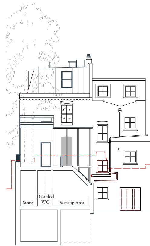
2 Consented North West Elevation from the Yard Approved Ref: 2022/1136/P - not yet built