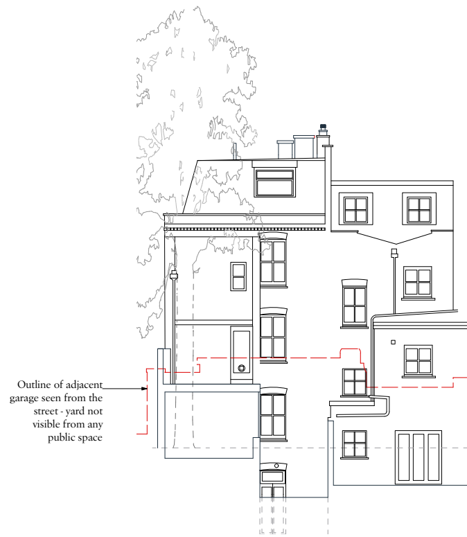
1 Existing North West Elevation from the Yard