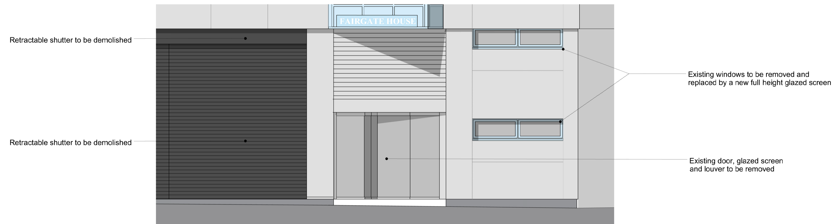
2 E-2 Main Entrance Existing Elevation 1 : 50