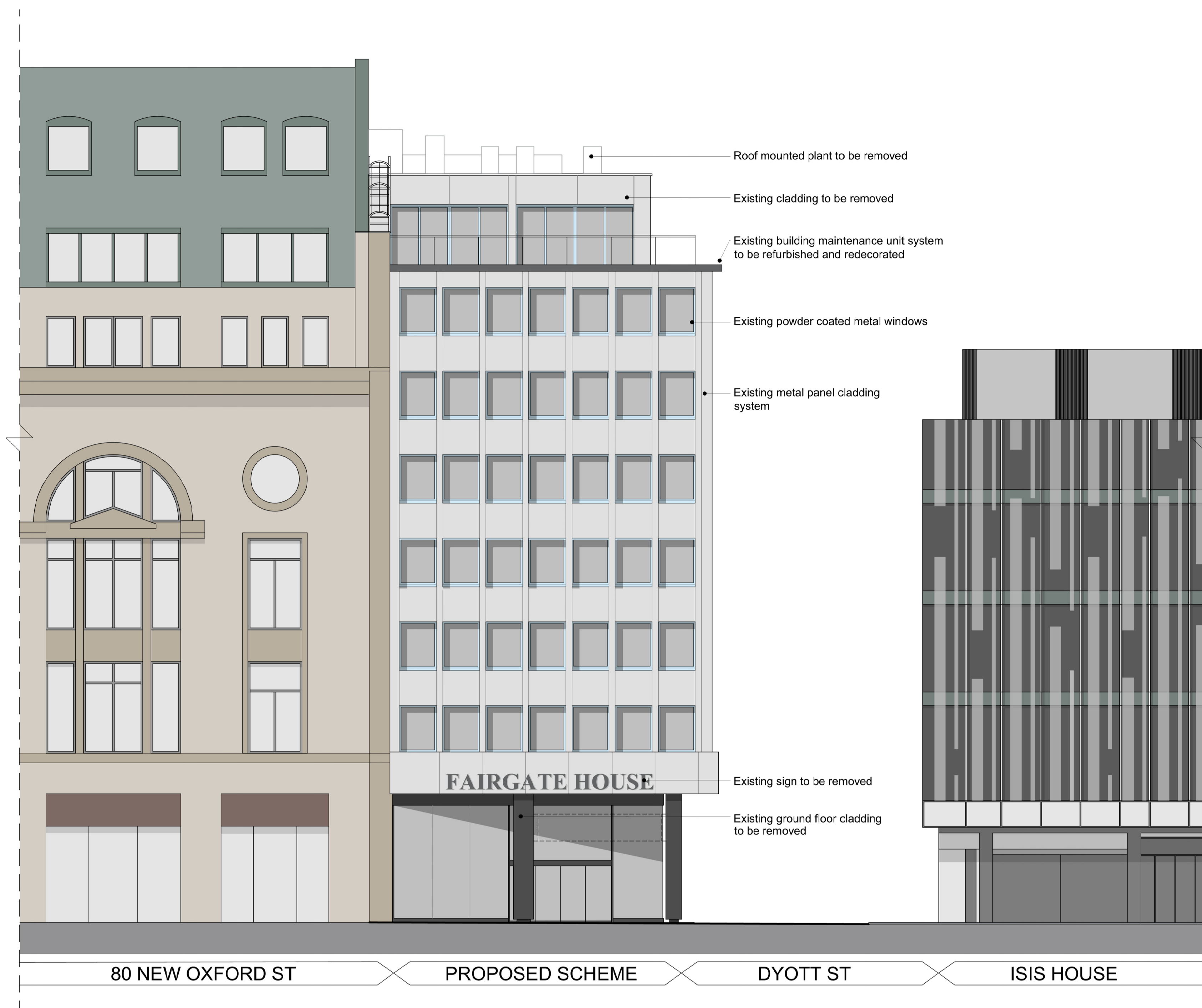
1 Existing New Oxford Street Elevation 1 : 100