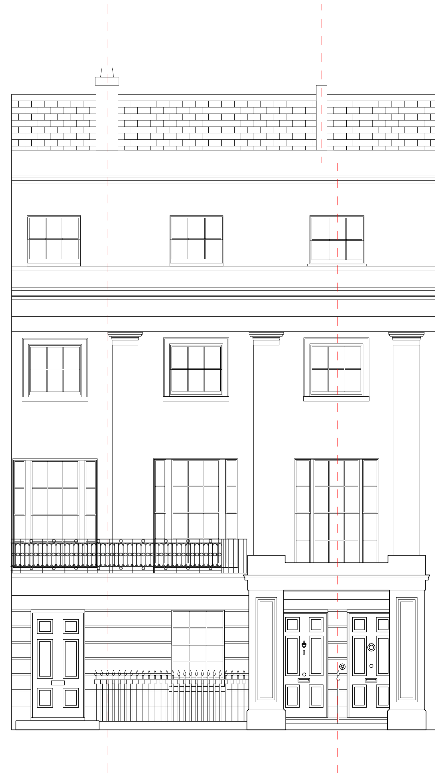
02 FRONT ELEVATION 1:50 @ A1