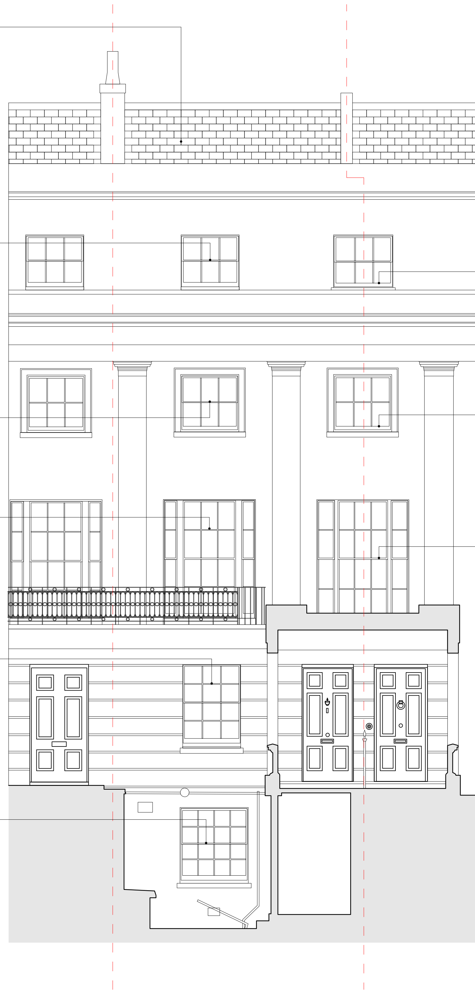
01 FRONT ELEVATION WITH SECTION AA 1:50 @ A1