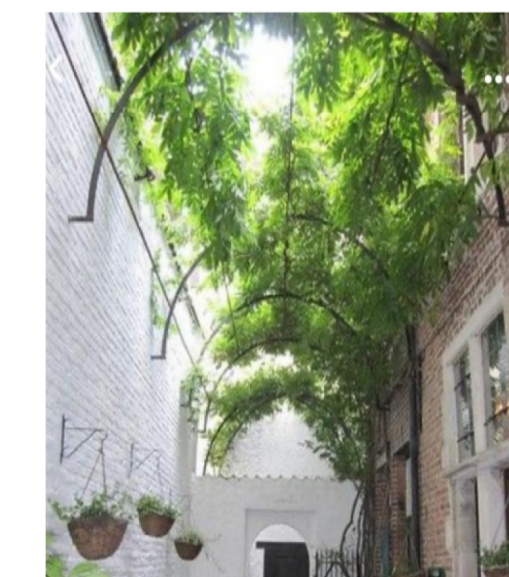
*Example of metal framed arch

New UPVC double glazed casement windows to side elevation