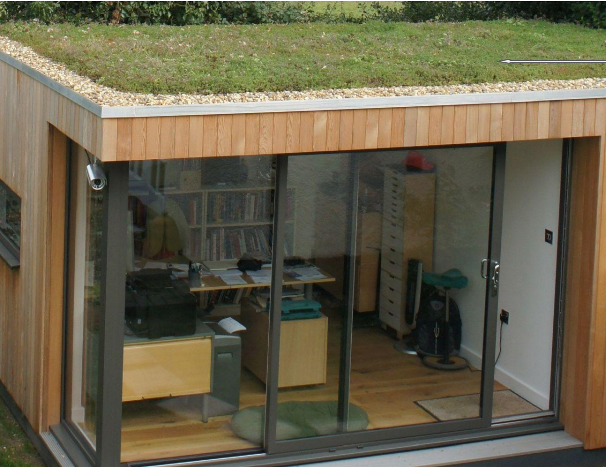
Sedum "Green" Roof