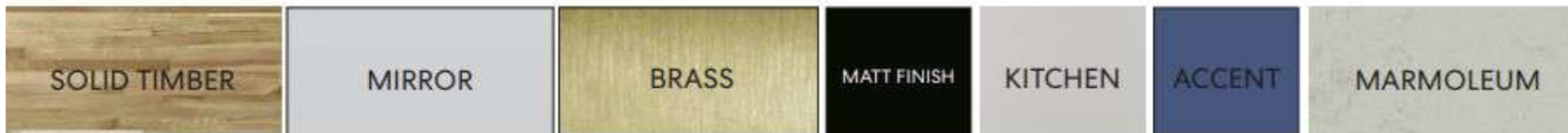
FINISHES & PALETTE