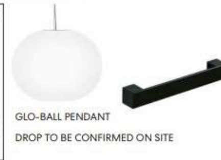
LOOK AND FEEL