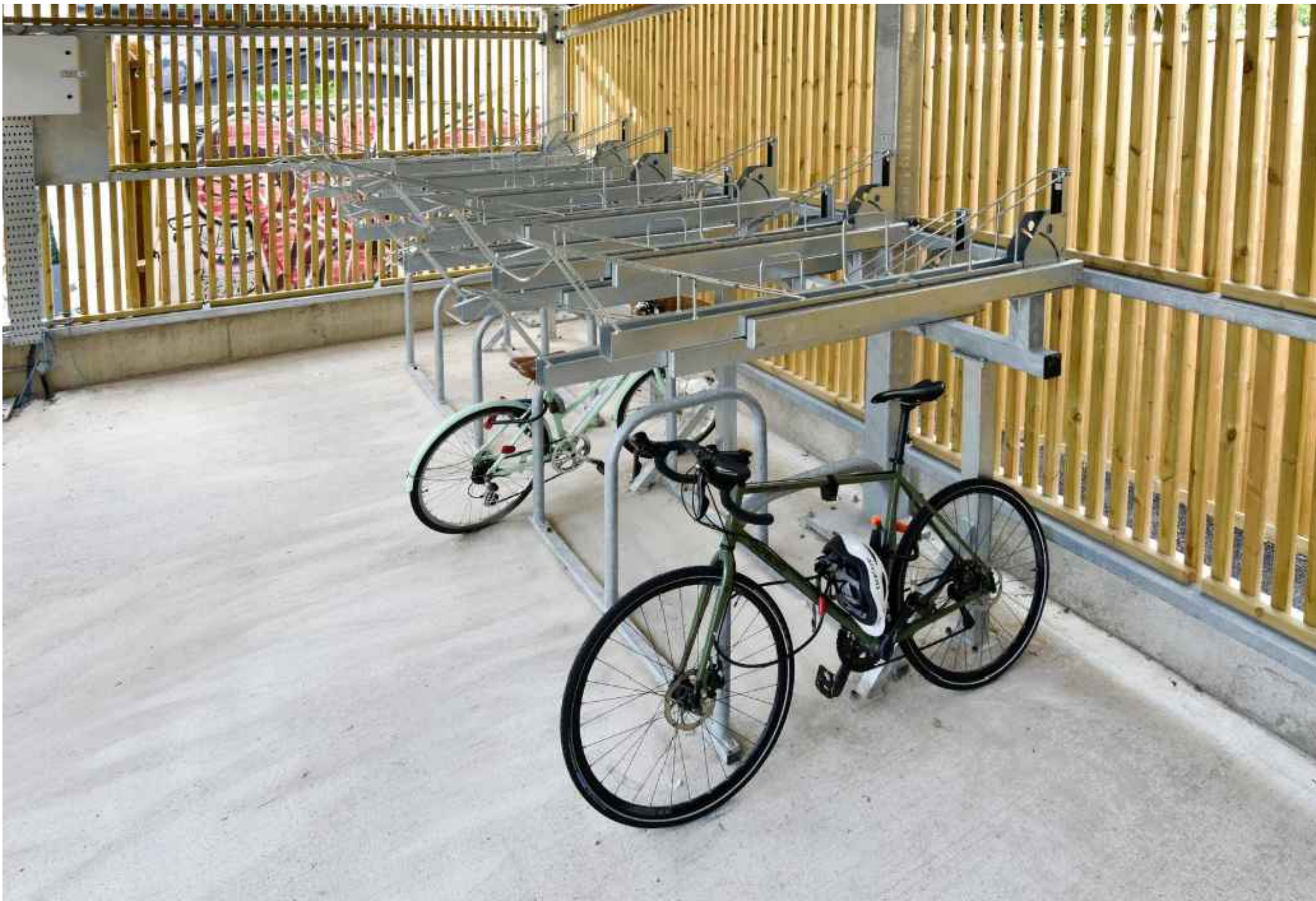
02 Broxap Two-Tier Easi-Riser Cycle Storage Racking n/a