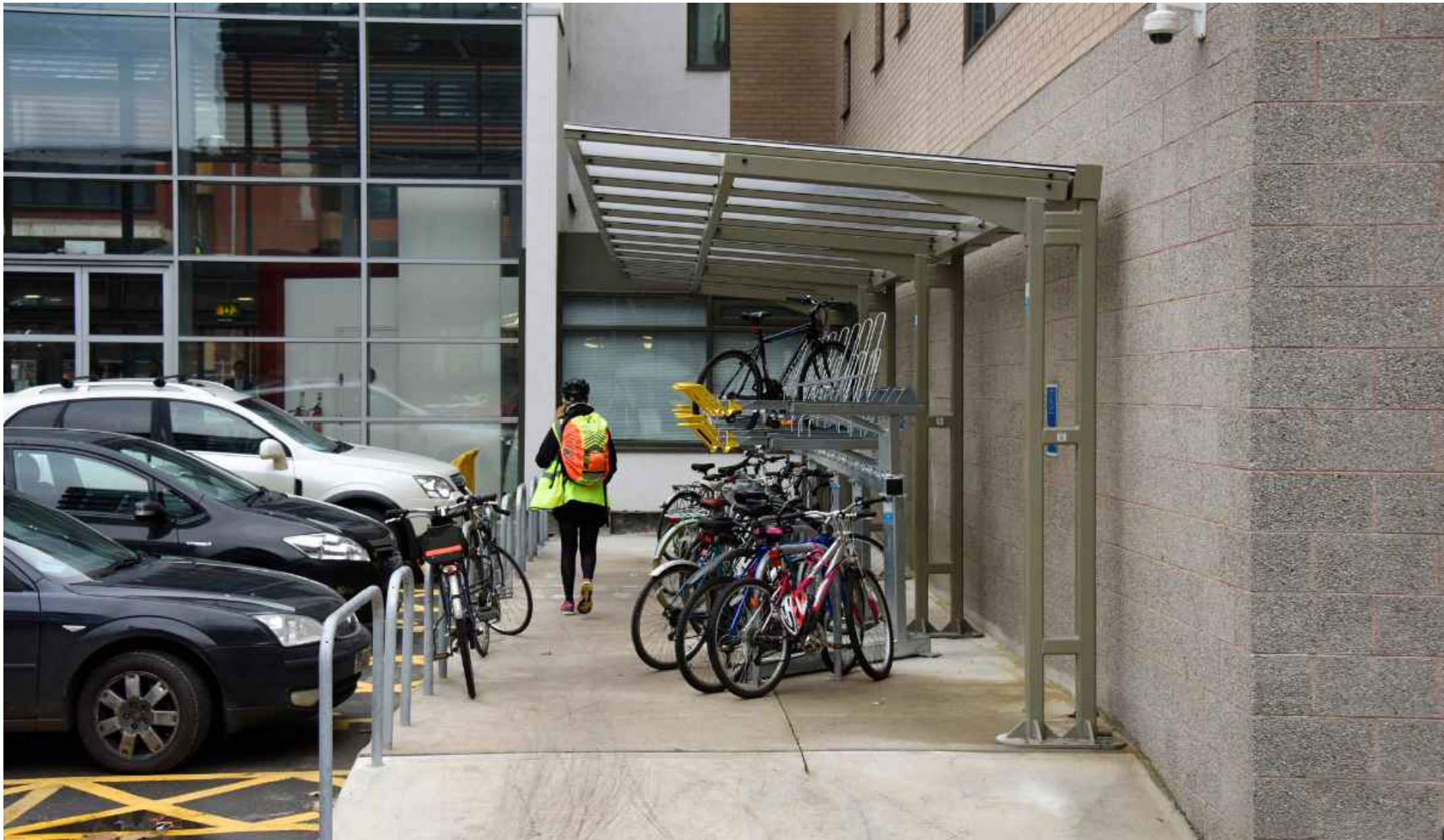
01 Broxap Coventry Cantilever Canopy n/a