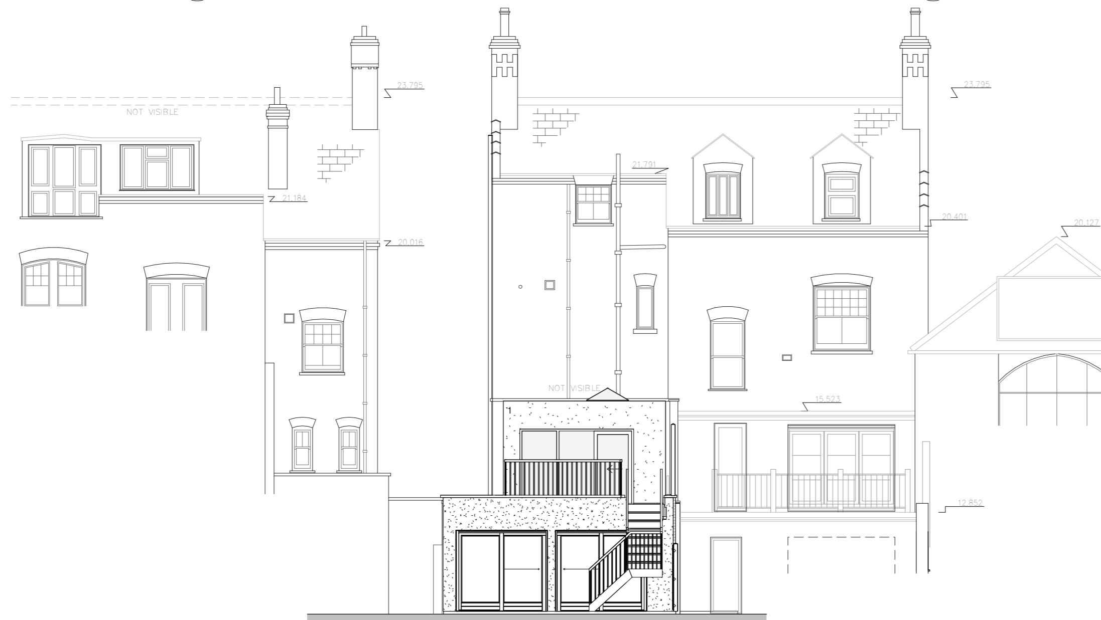
1 07.3 North elevation - as existing p302B 1 : 100