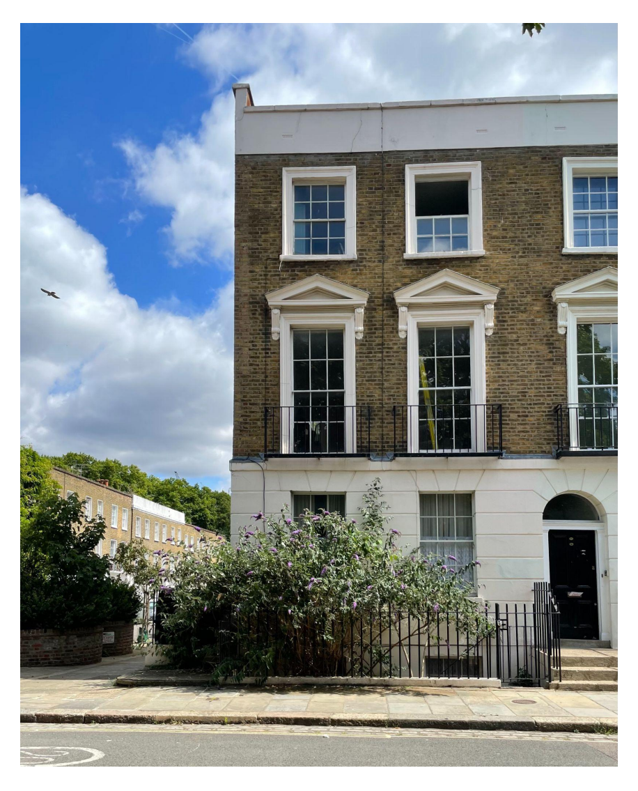
Front view of the site (31 Medburn St)

Located at the junction of Medburn Street and Charrington Street, the application building is the end property of the typical Georgian residential terrace at Charrington Street.