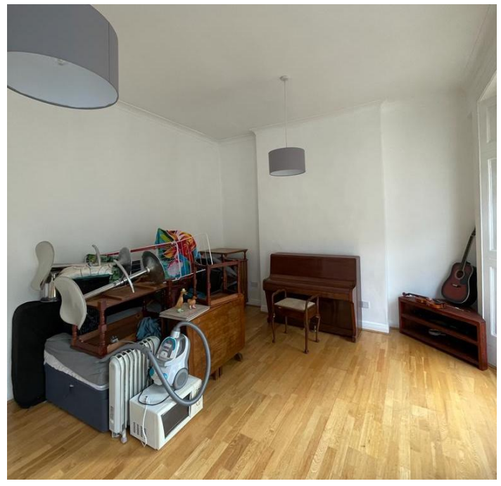
reception room - missing fireplace (31 Medburn St)