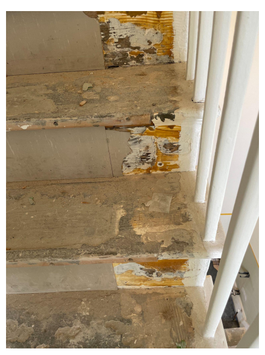
original staircase and exposed insensitive interventions (31 Medburn St)