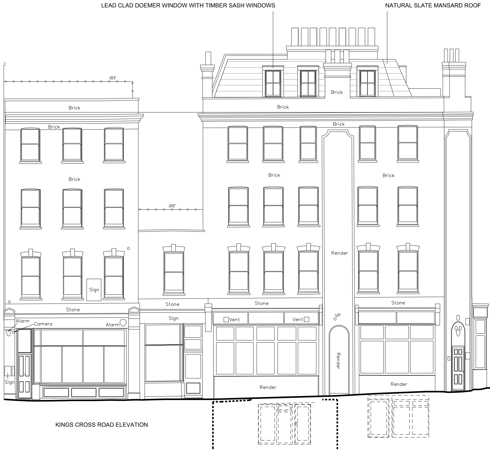
KINGS CROSS ROAD ELEVATION