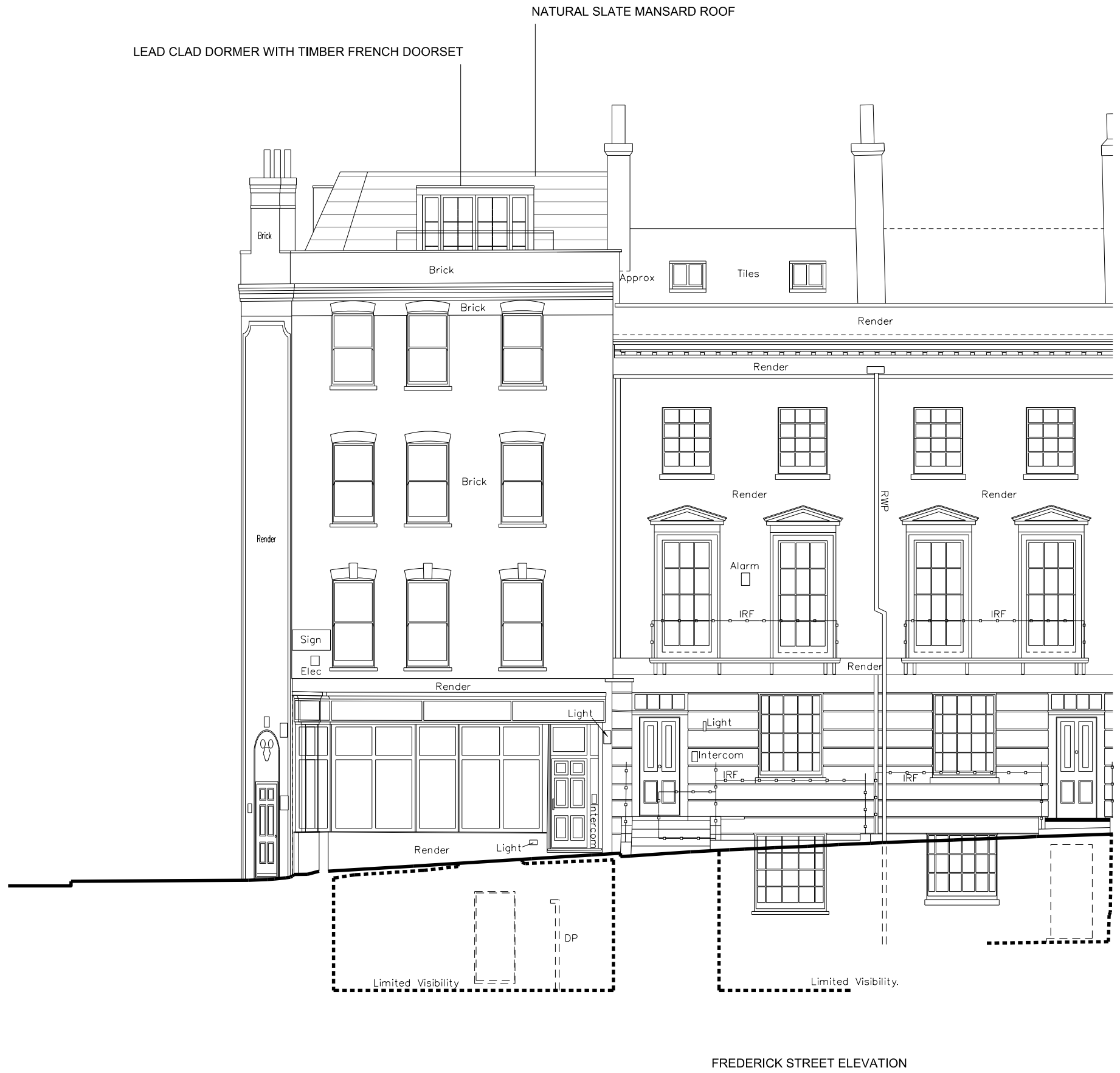
FREDERICK STREET ELEVATION