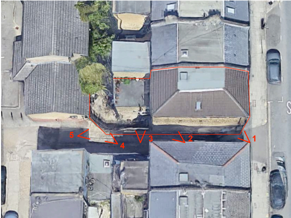
Aerial view of 63 Fortress Road Flank Elevation context