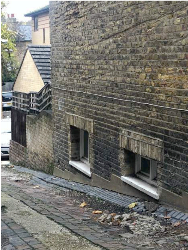
2 - 63 Fortress Road Lower Ground Floor Plan side windows