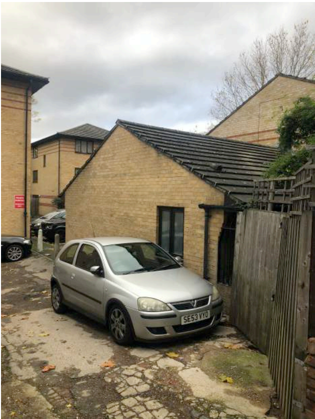
4 - 63 Fortress Road rear courtyard boundary fence