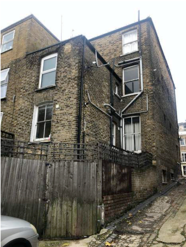
5 - 63 Fortress Road Flank and Rear Elevations from Fortress Yard lower level