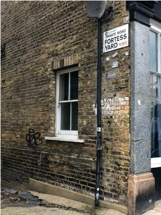
1 - 63 Fortress Road Ground Floor Plan side window