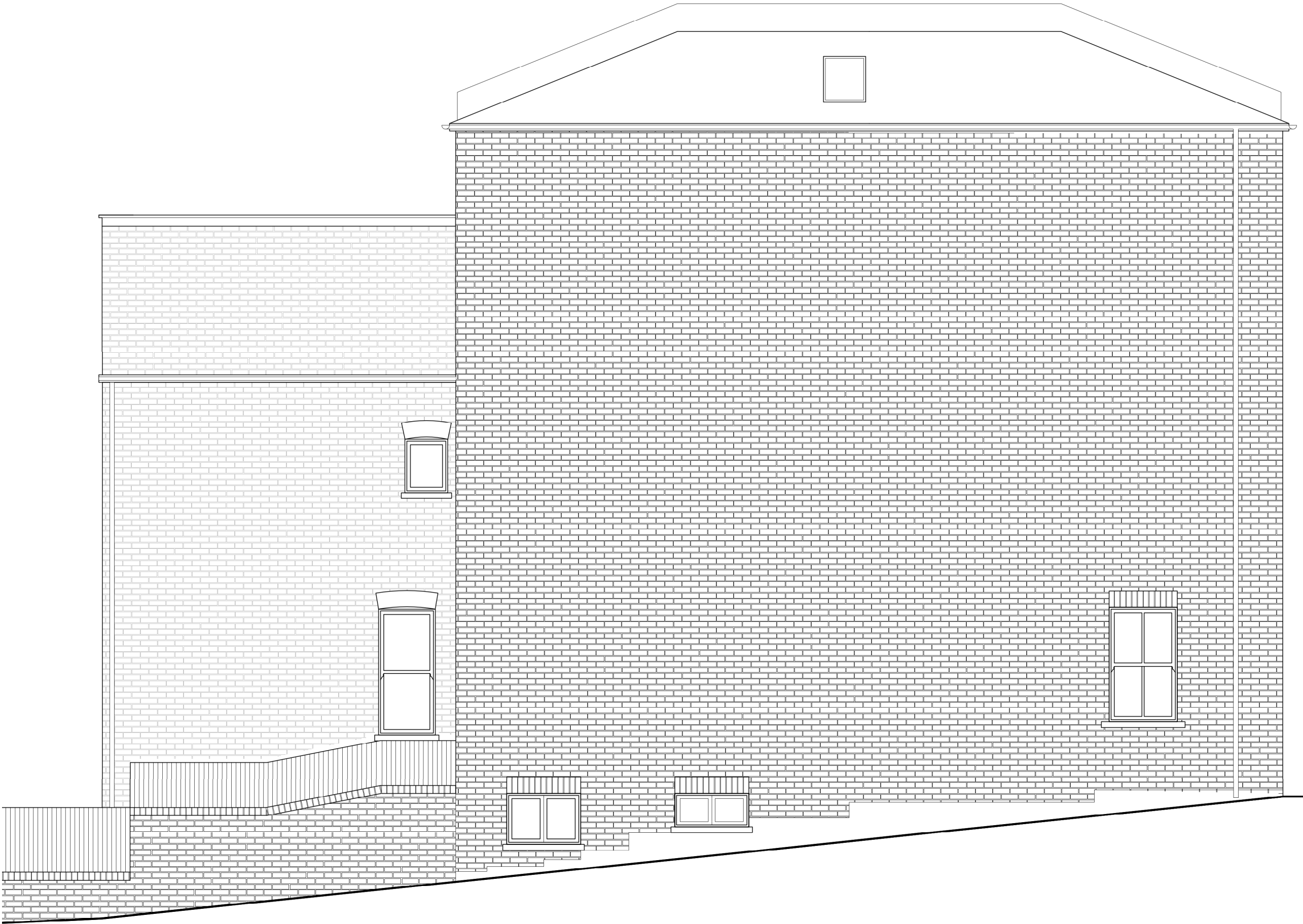
Flank Elevation (Fortess Yard)