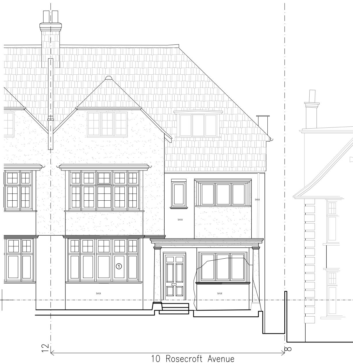
Proposed Elevation – A : Street Elevation