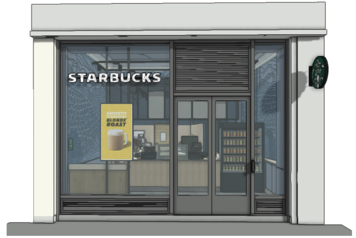
Proposed front elevation render (nts)

Existing aluminium frame to be repainted RAL 7021