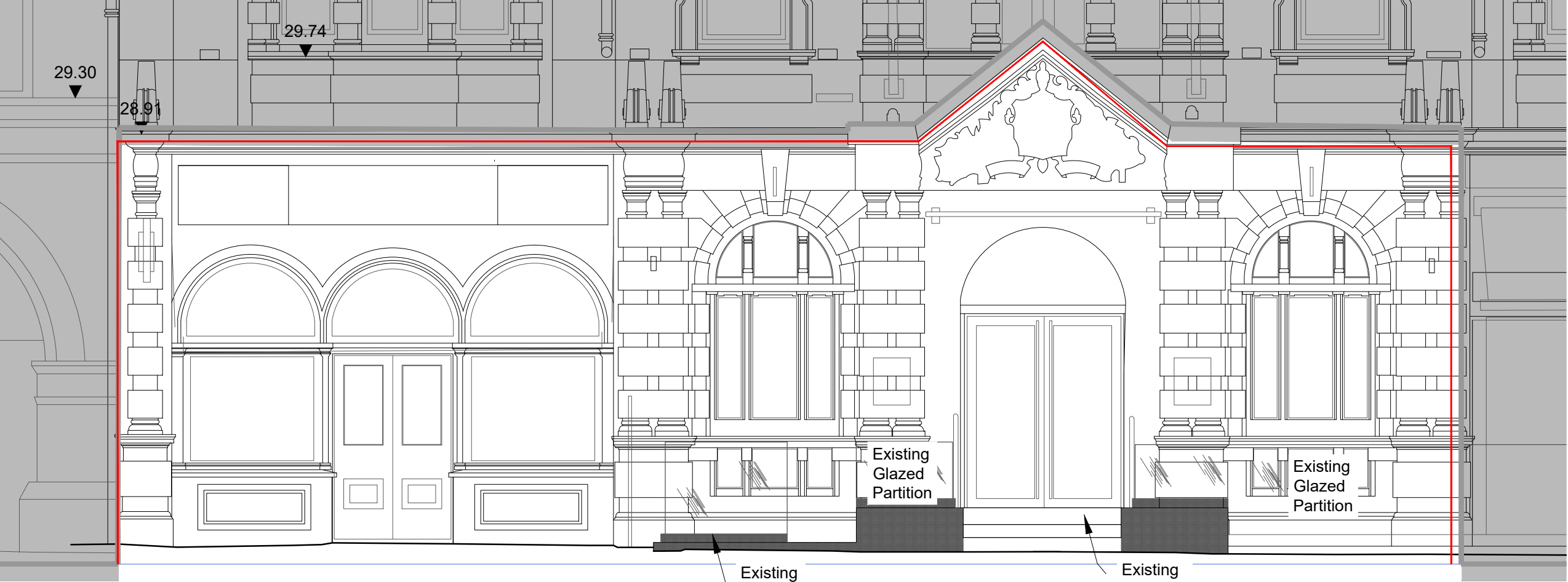
EXISTING ELEVATION Scale 1:50