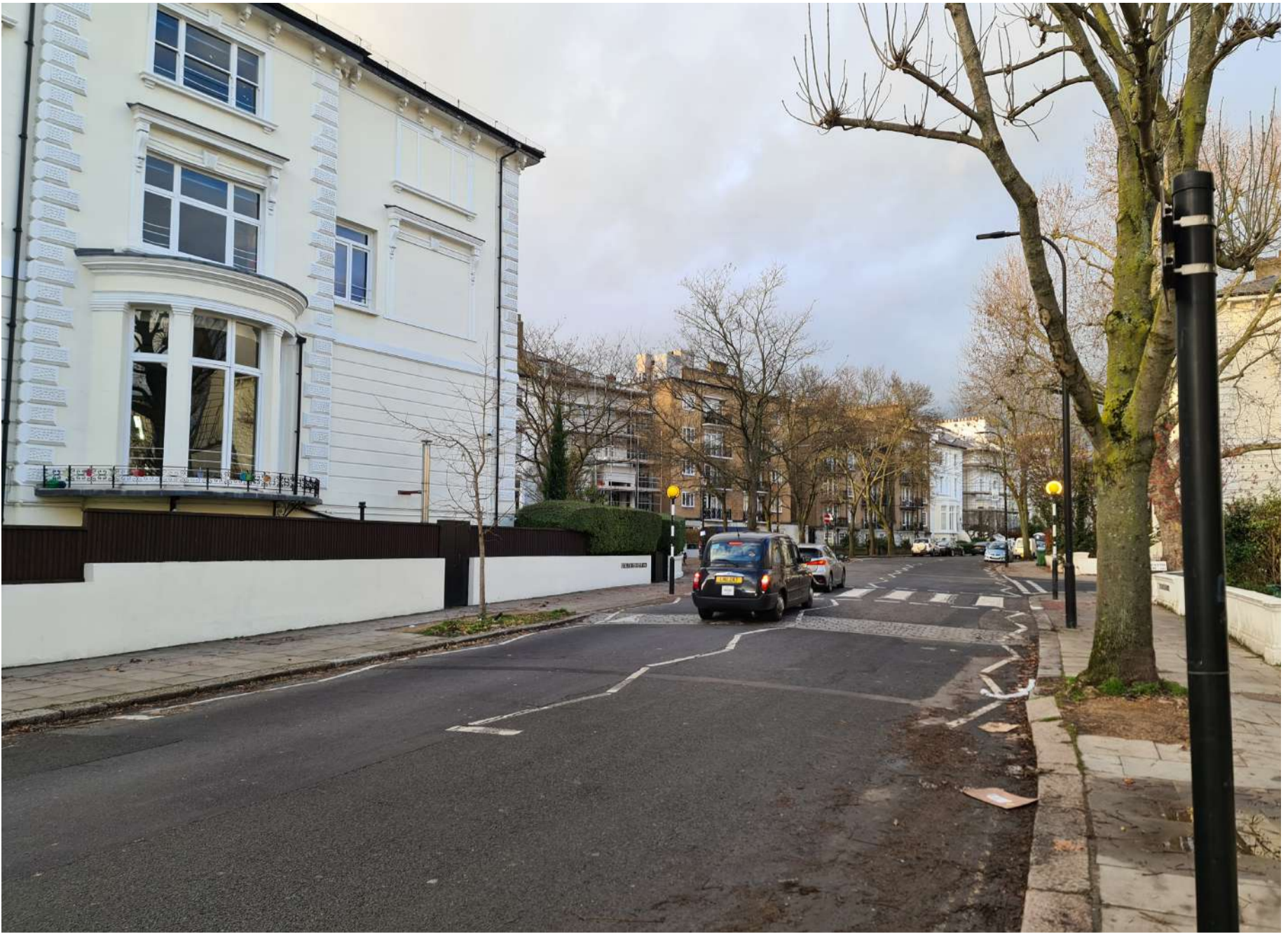
Image 3a Existing view from Buckland Crescent looking North.