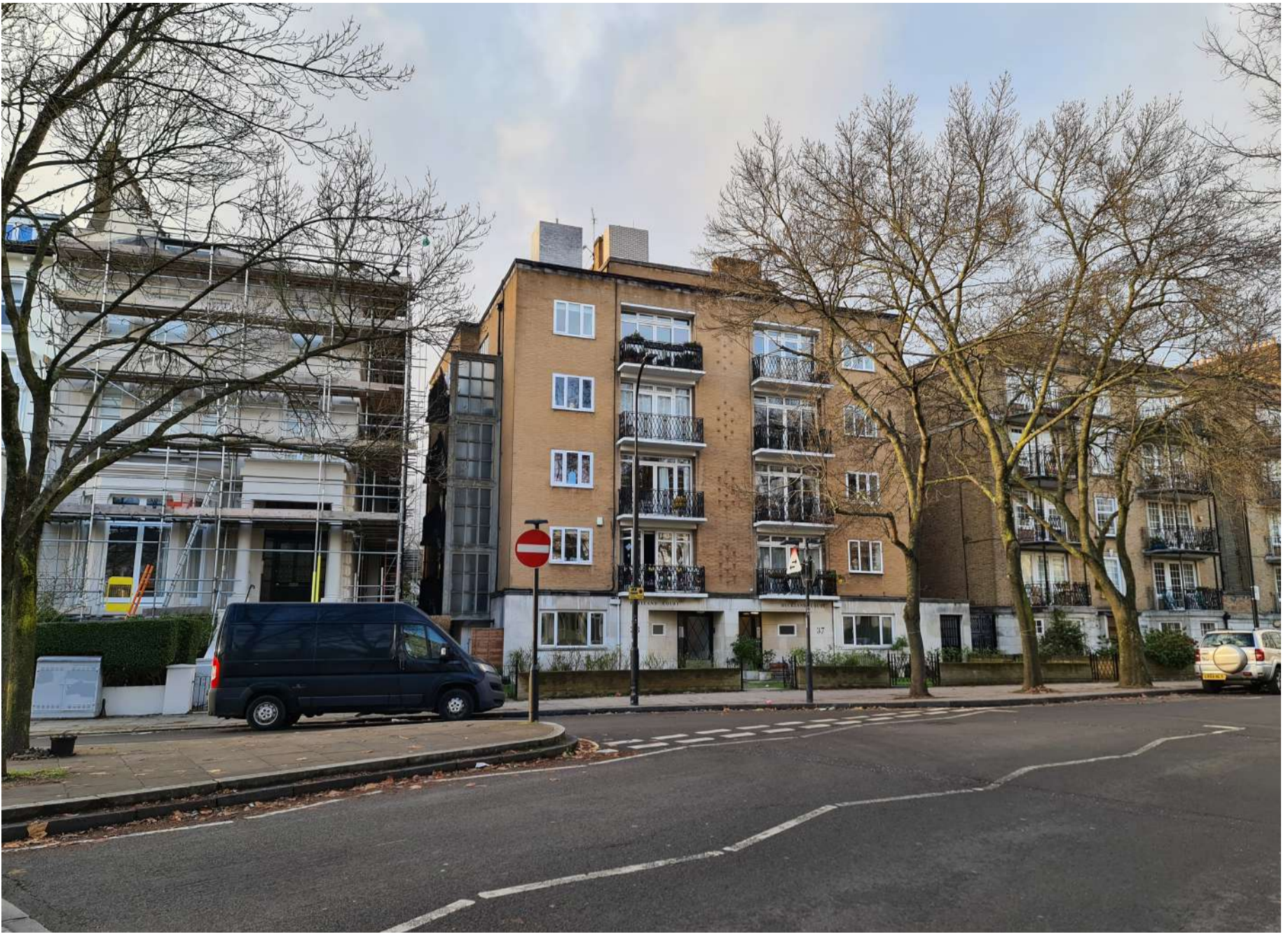
Image 2a Existing view from Buckland Crescent looking North West.