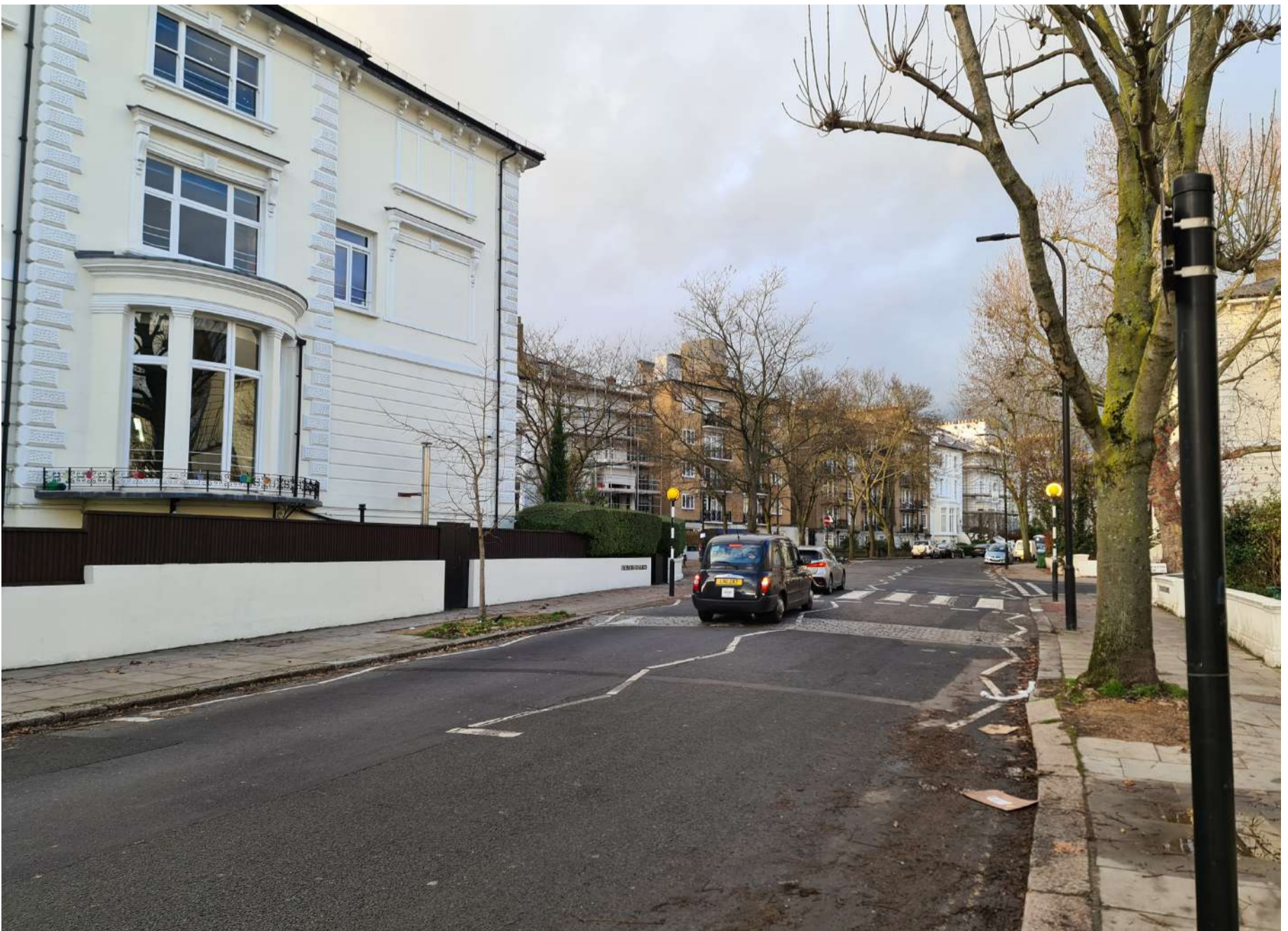
Image 3b Proposed view from Buckland Crescent looking North.