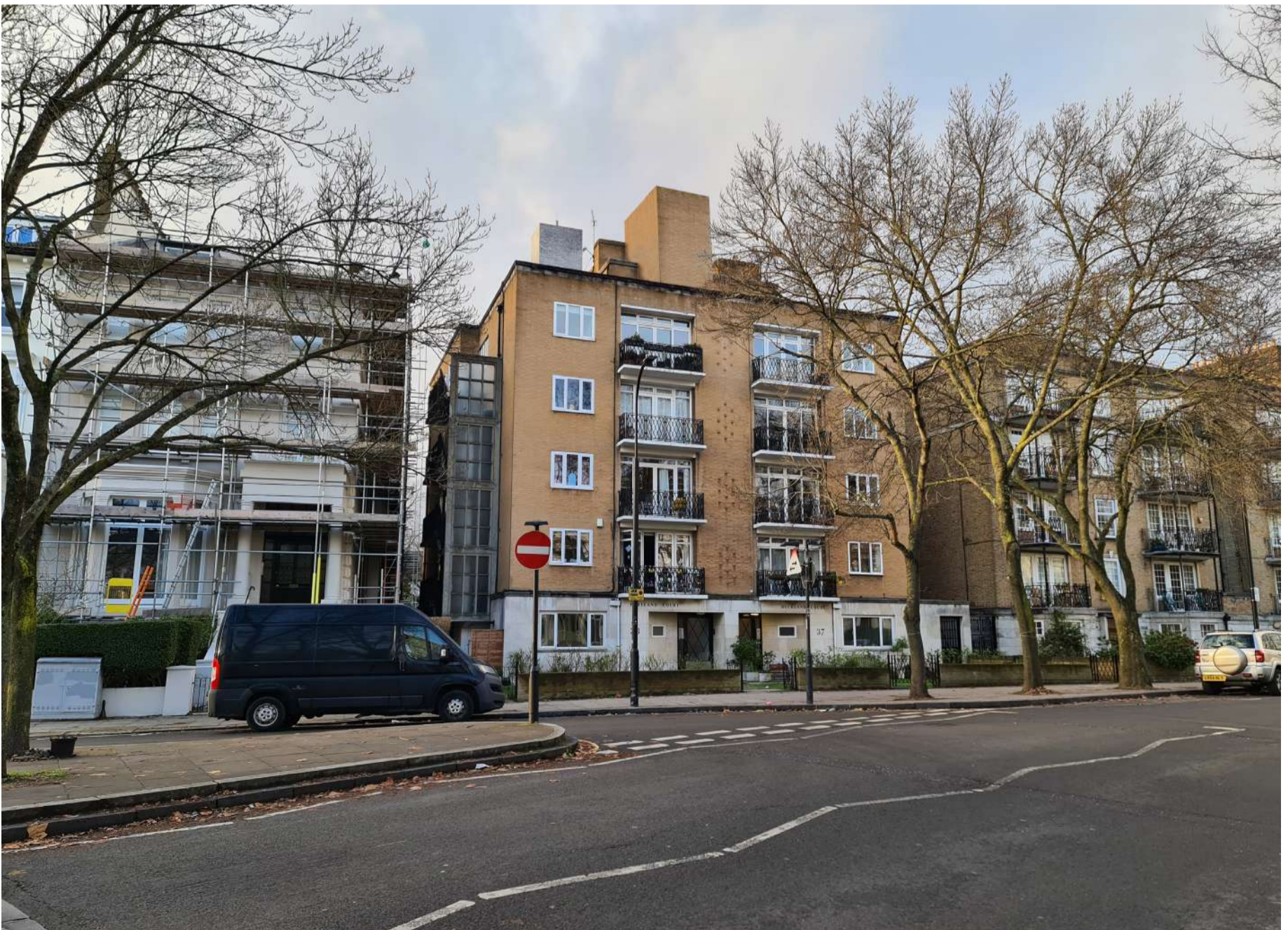
Image 2b Proposed view from Buckland Crescent looking North West.