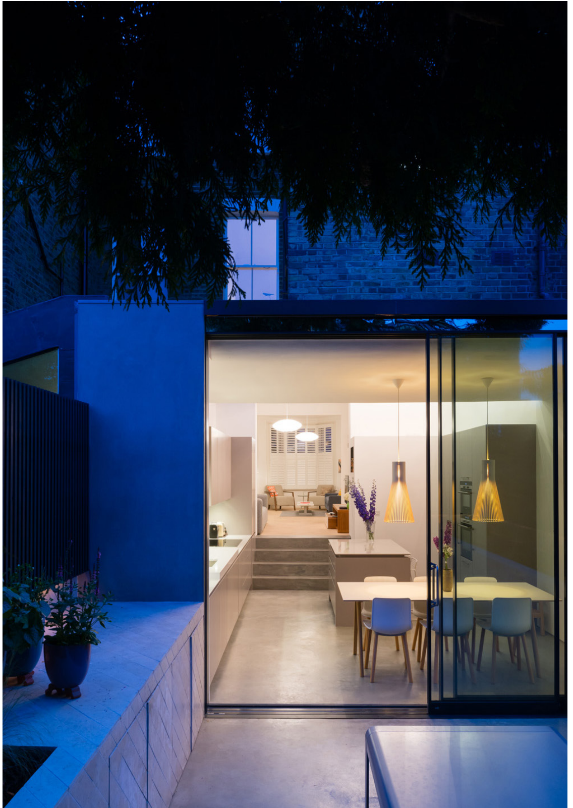
An extension and refurbishment of a house at Calabria Road, Islington by Architecture for London