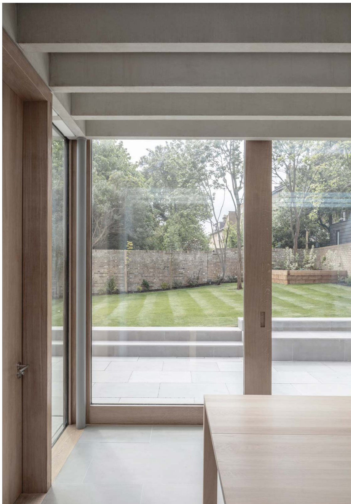
House at Dartmouth Park, Camden Council, by Architecture for London