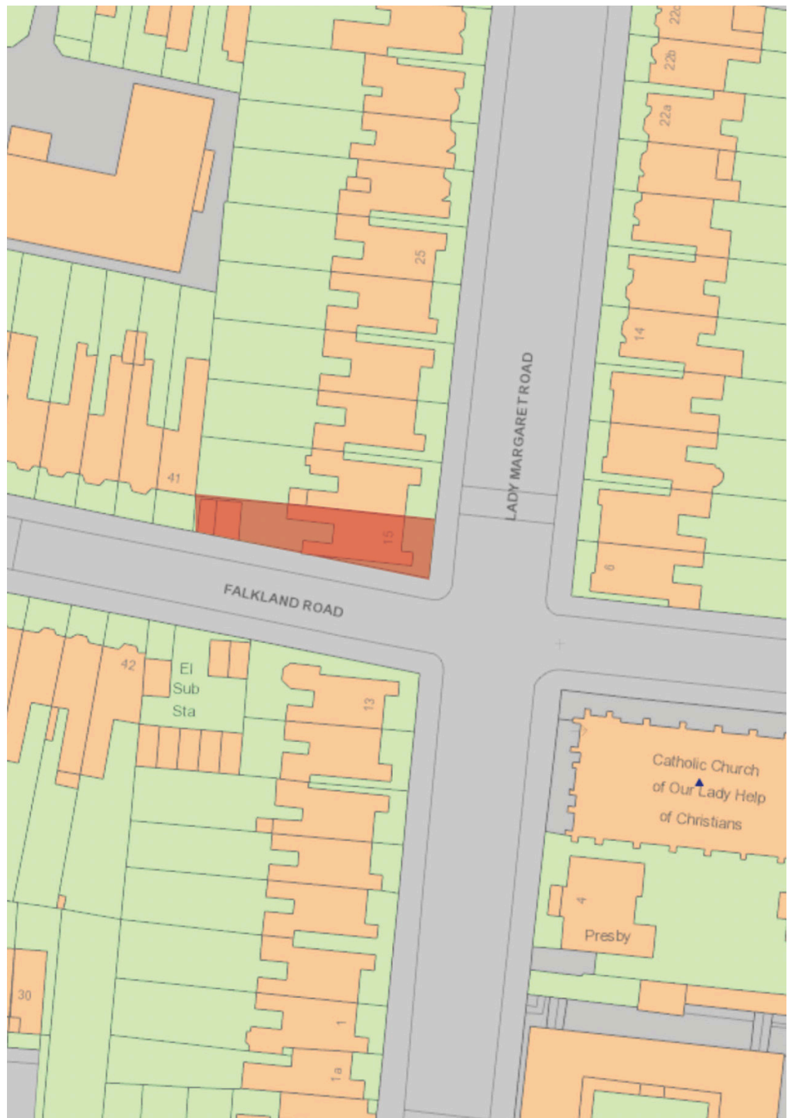
OS site map showing 15 Lady Margaret Road