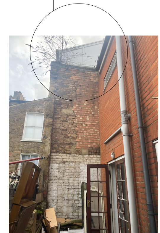
View of Existing Roof - Adjoining Building on Iverson Road