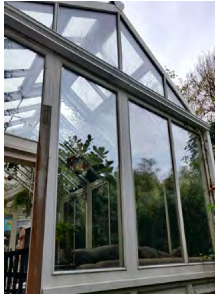
Rear of glazed structure

Although the building has been maintained as a residence continuously, the condition of the building fabric is very poor and requires some building work to improve this.