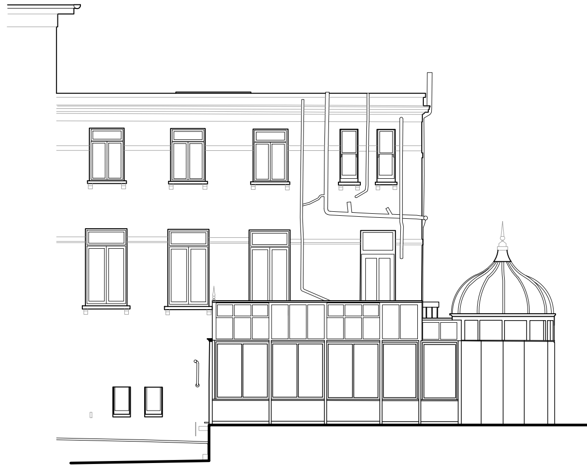
○ Back elevation EXISTING