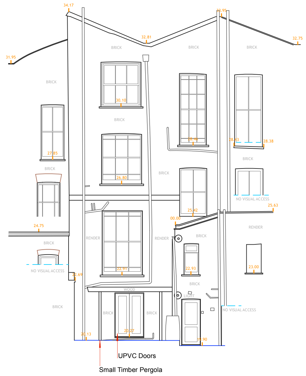
1 Rear Elevation Scale: 1:100