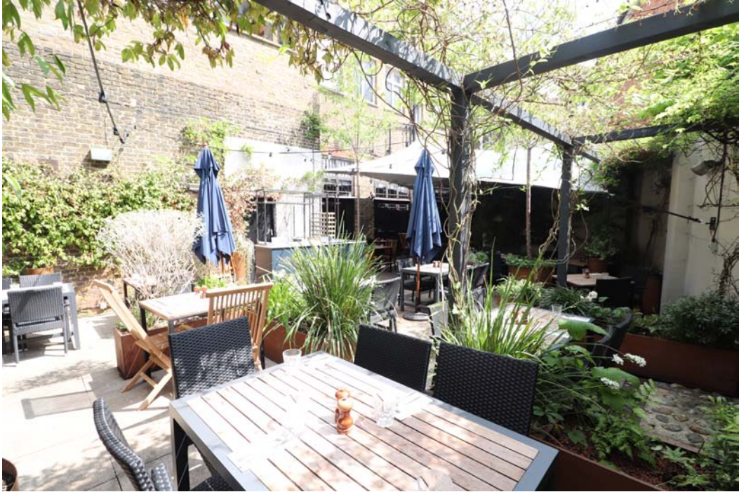
Rear Elevation where new door openings will be located.