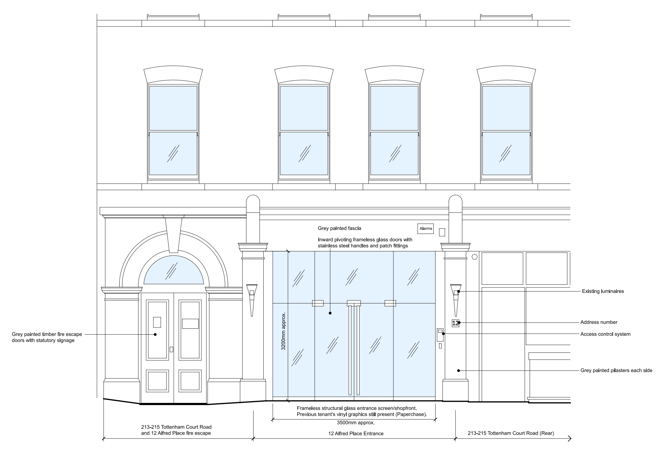
Existing Alfred Place Entrance Elevation (1:50 @A3)