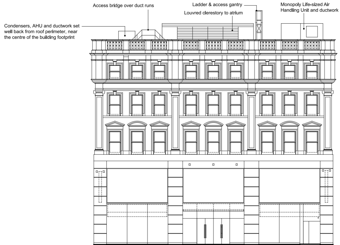
Existing Tottenham Court Road Elevation