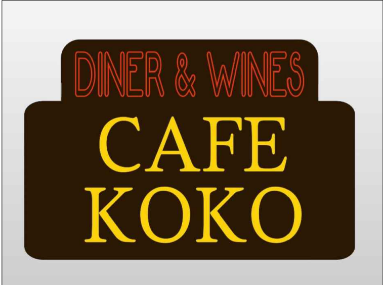
Proposed Projecting Sign

General Notes All Dimensions To Be Checked And Verified On Site. Please Report Omissions And Any Discrepancies To The Designers Immediately. All Works To Comply With Current Building Regulations If Printed From A PDF This Drawing Is Not To Scale And Is Therefore For Reference Only