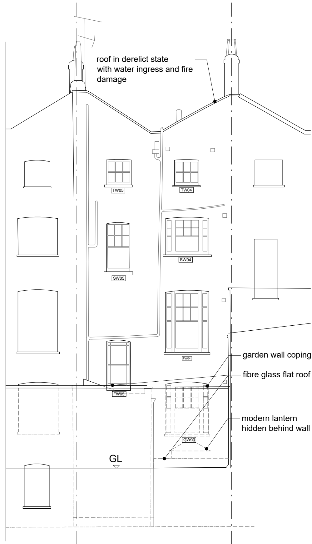
2 Existing Rear Elevation Scale: 1:100

All dimensions to be checked on site prior to construction or manufacture. Do not scale from this drawing. Refer also to written specification of works where applicable. Any discrepancies to be verified with Architects prior to commencement of works.