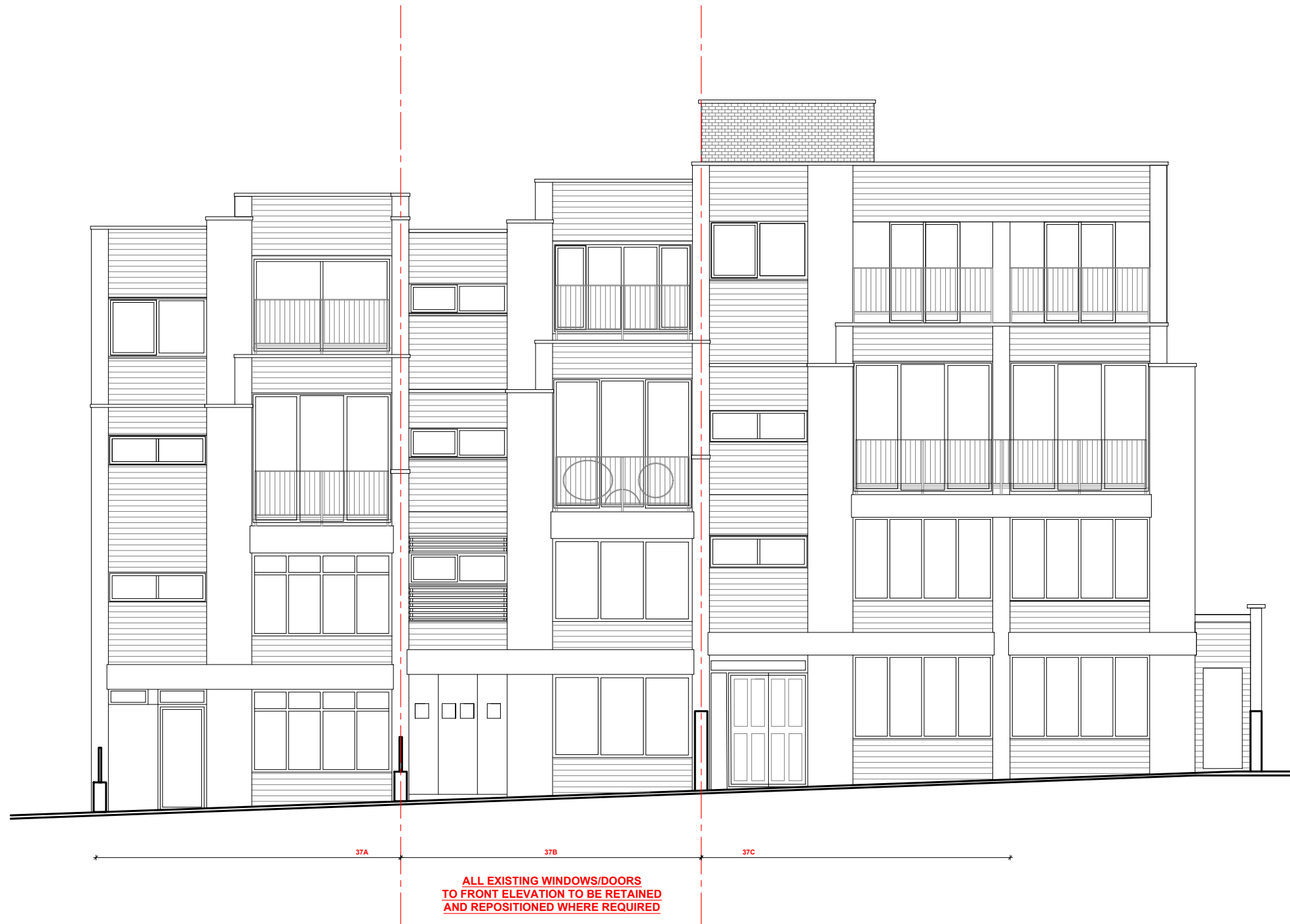
1 FRONT ELEVATION - PROPOSED_ SCALE 1:100 @ A3