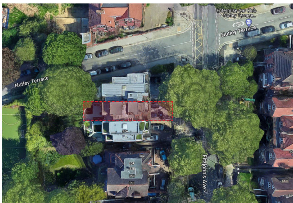
Aerial view of 37B Fitzjohn's Avenue.