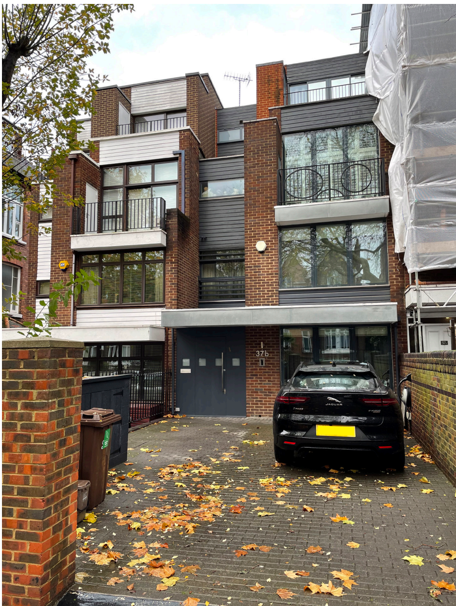
Front view of No. 37B Fitzjohn's Avenue and its front paved forecourt (view during the works at No. 37C, currently ongoing).