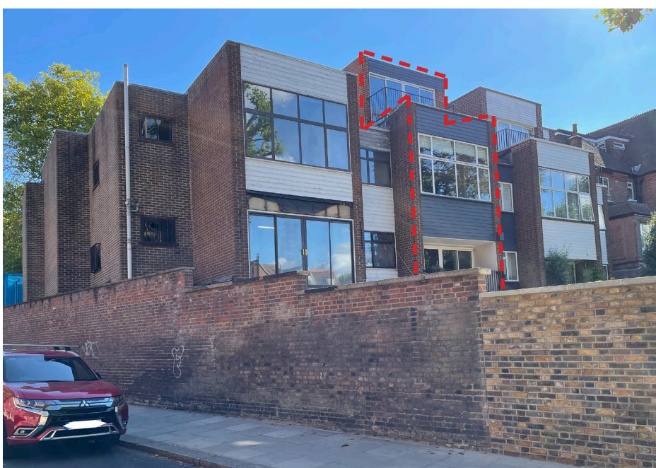
View of No. 37B Fitzjohn's Avenue from Nutley Terrace (view before the works at No. 37C, currently ongoing).