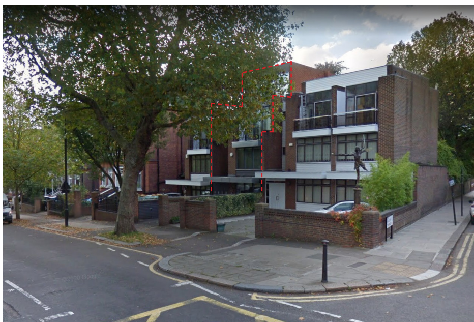
37A /B/C - 1960'S End block at Nutley Terrace. View before the start of the works at No. 37C.