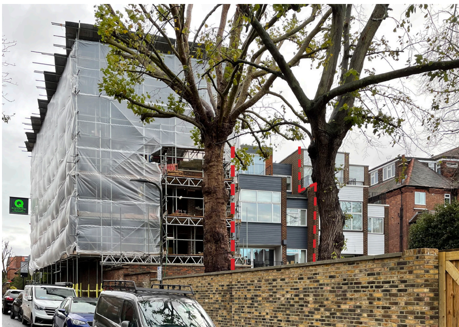
View of No. 37B Fitzjohn's Avenue from Nutley Terrace (view during the works at No. 37C, currently ongoing).