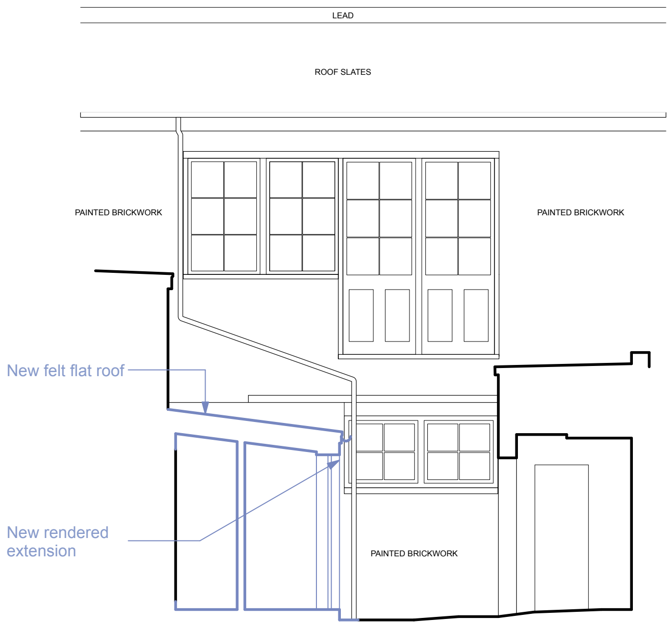
REAR ELEVATION - E3