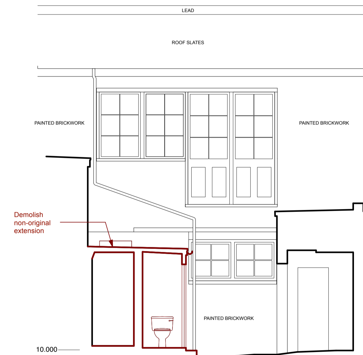
REAR ELEVATION - E3

ibla 020 7580 8808 www.ibla.co.uk postroom@ibla.co.uk