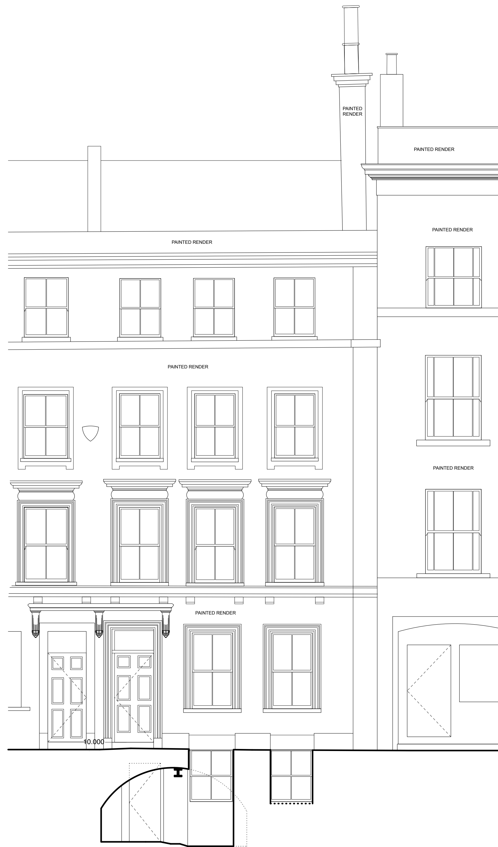
FRONT ELEVATION - E1