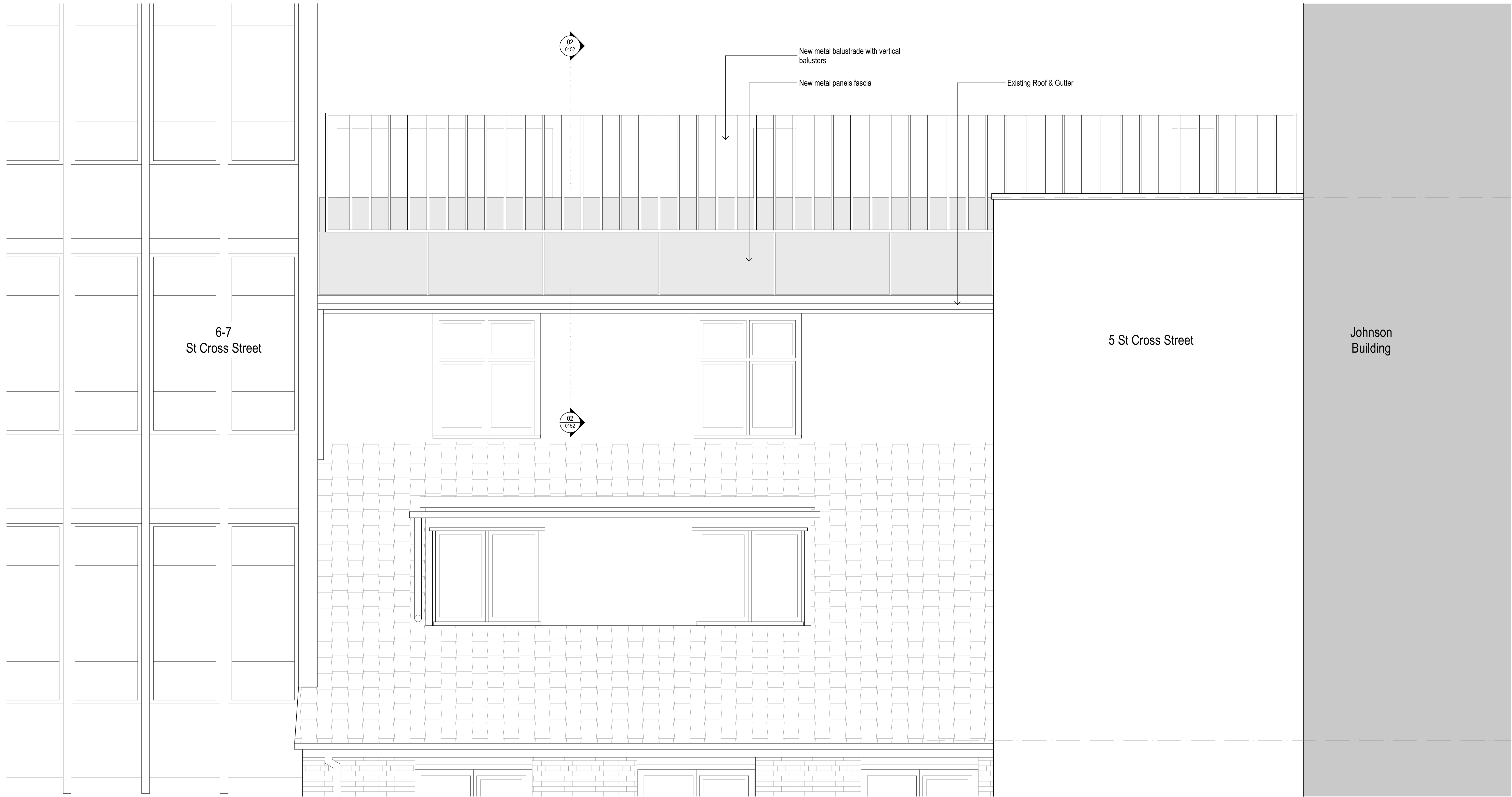
1 Proposed Terrace South Elevation Detail SCALE 1:25