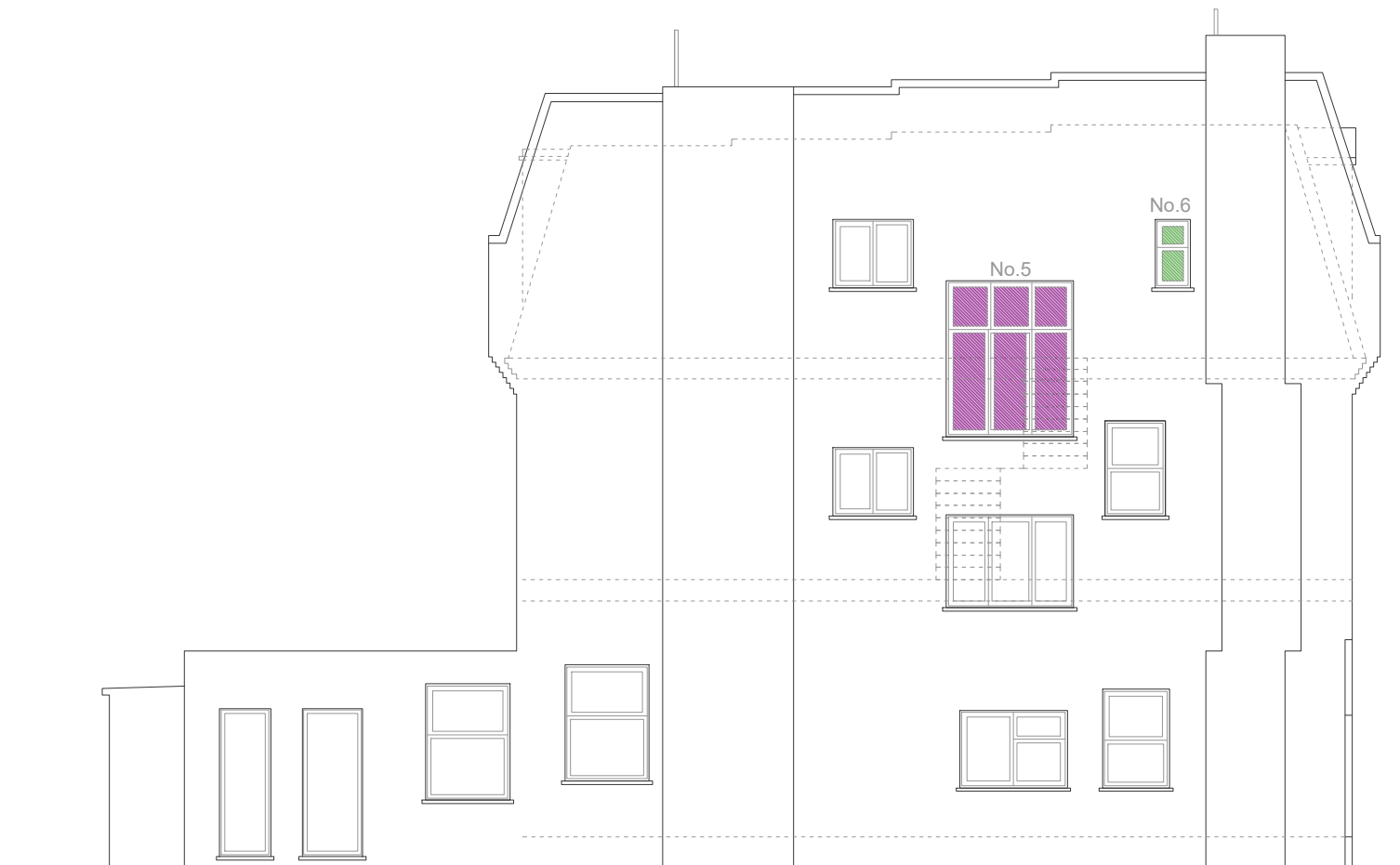
SOUTH WEST SIDE ELEVATION E: 1/100