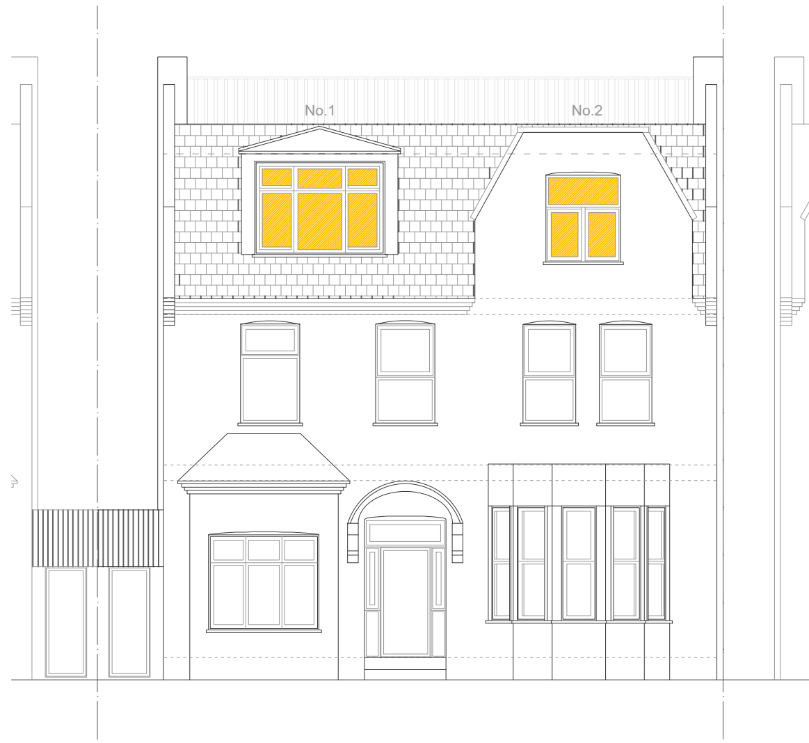
FRONT ELEVATION E: 1/100