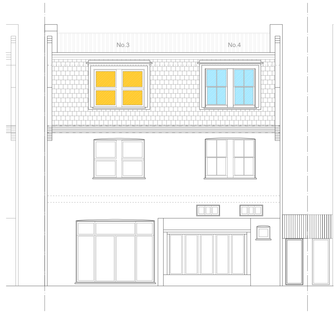
REAR ELEVATION E: 1/100