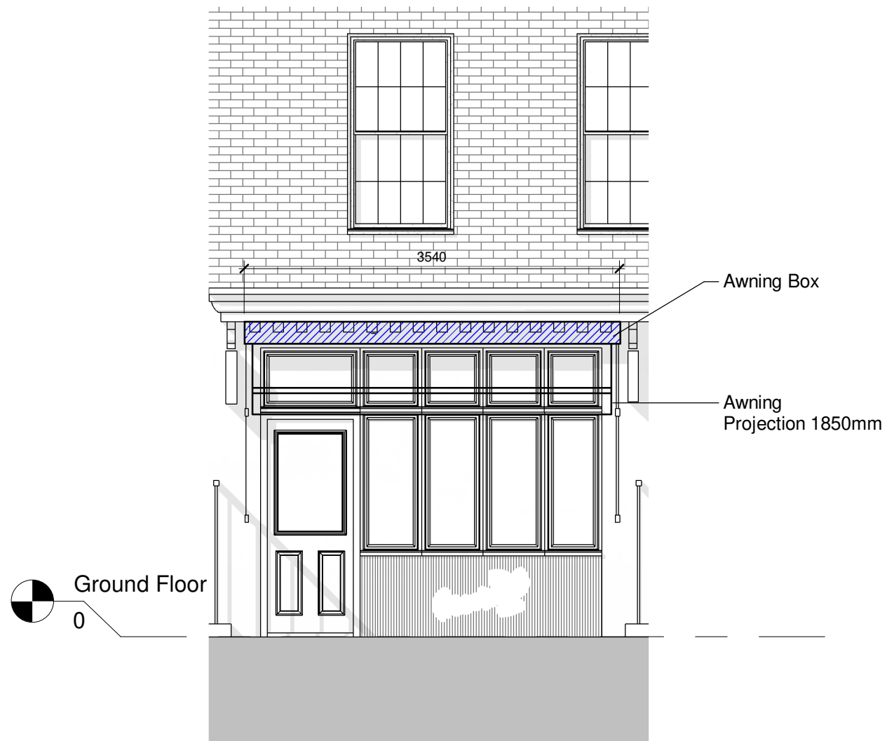
Front Elevation 1 : 50