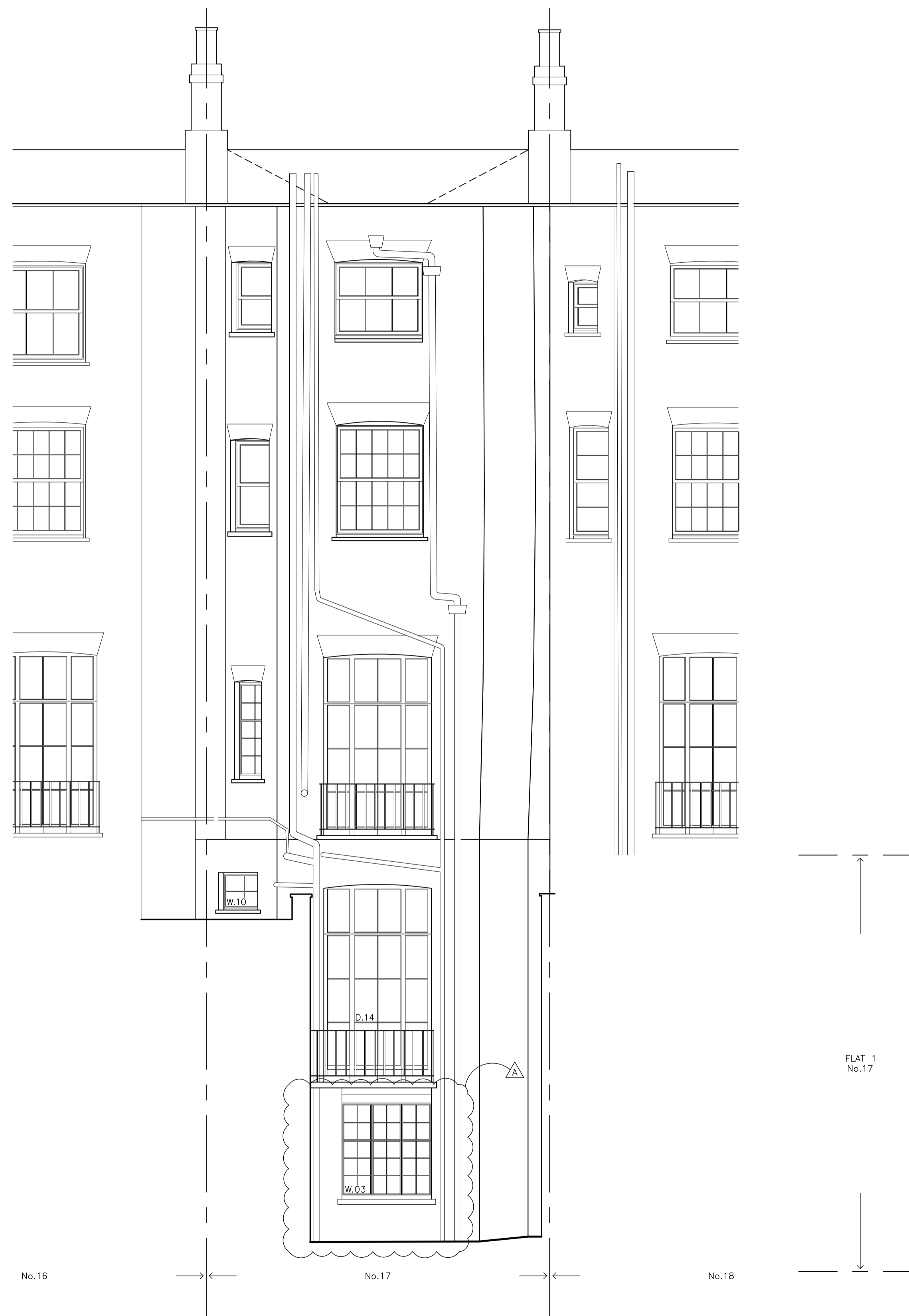
004 PROPOSED EAST ELEVATION (REAR)