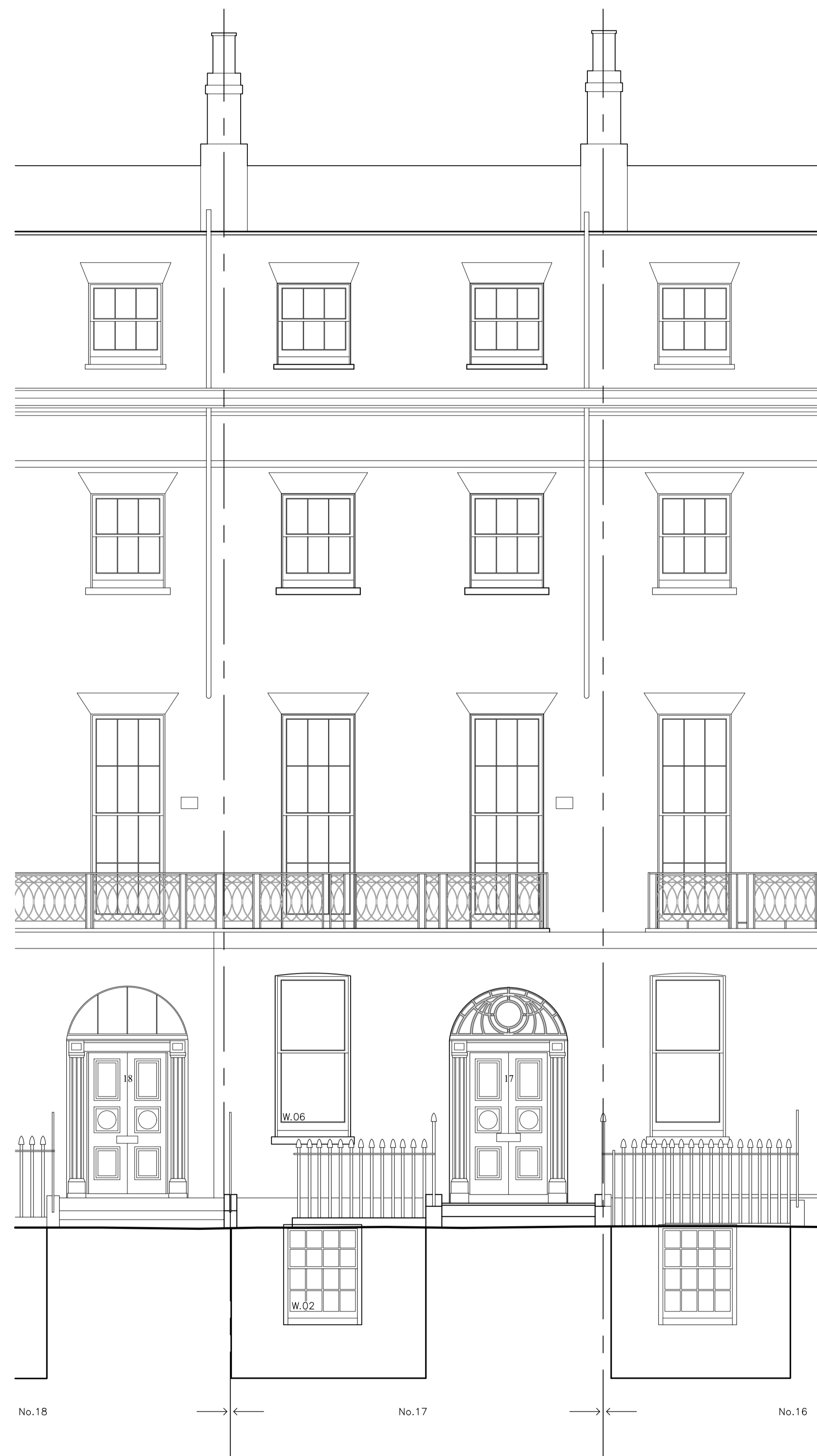
004 PROPOSED WEST ELEVATION (FRONT)