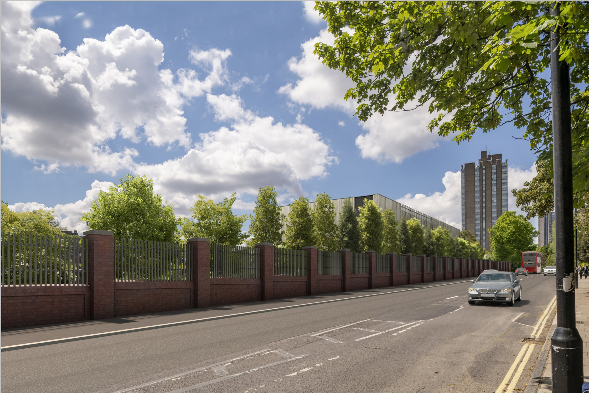
Viewpoint 54 : Operation Year: 1