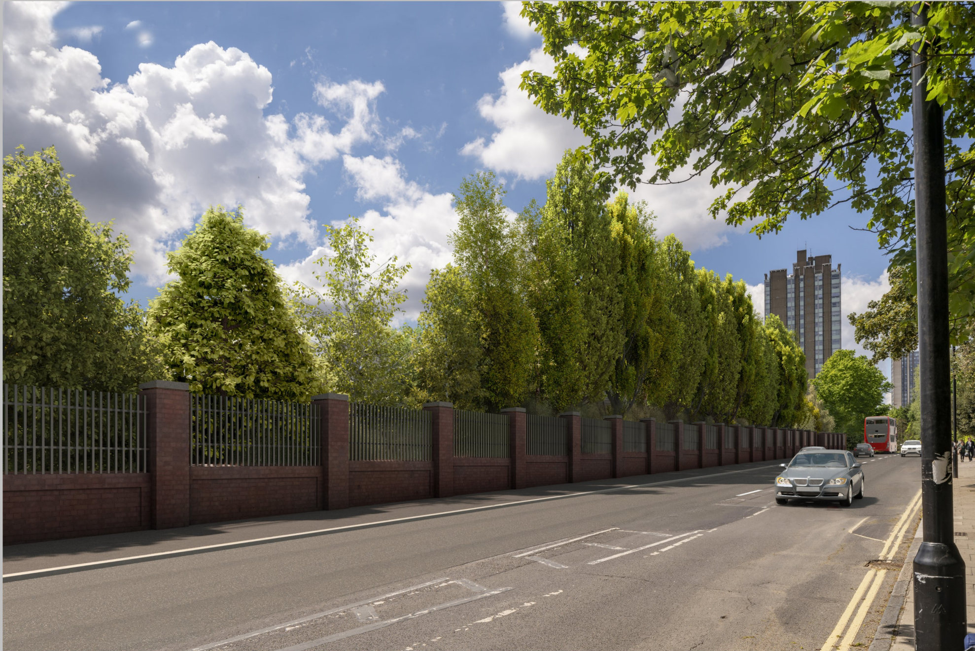
Viewpoint 54 : Operation Year: 15