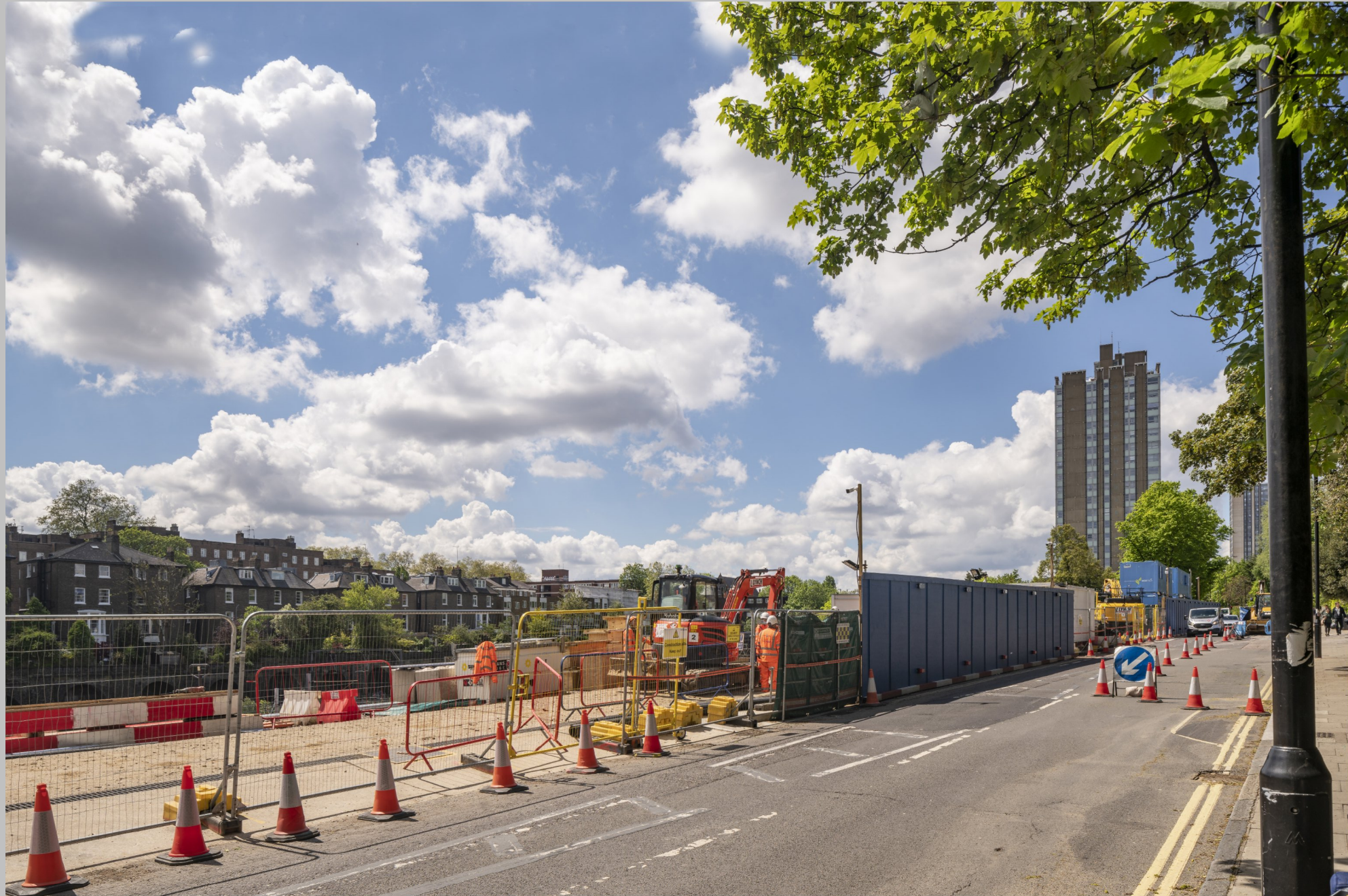
Viewpoint 54 : Year 0 Photography 2021