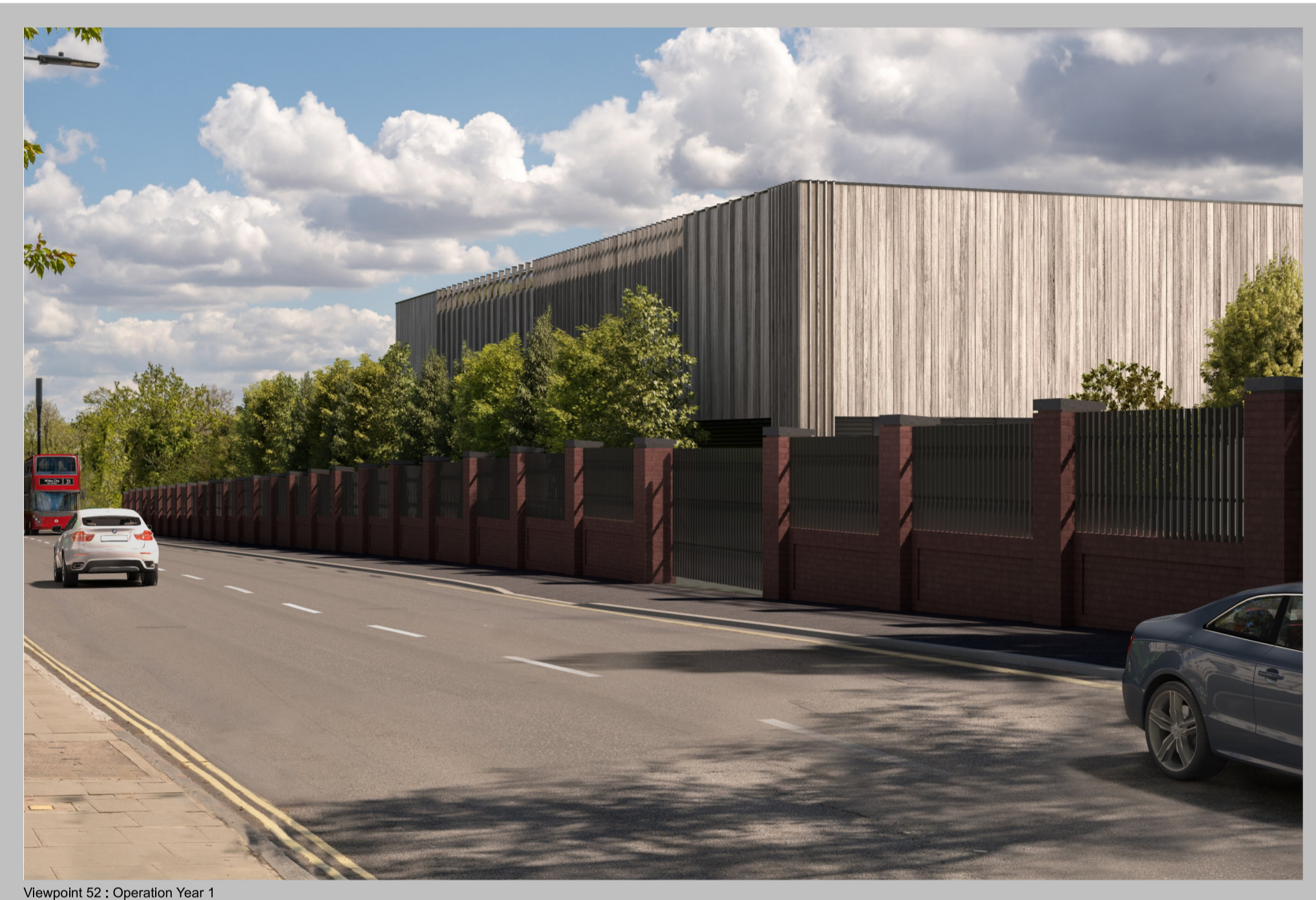
Viewpoint 52 : Operation Year: 1