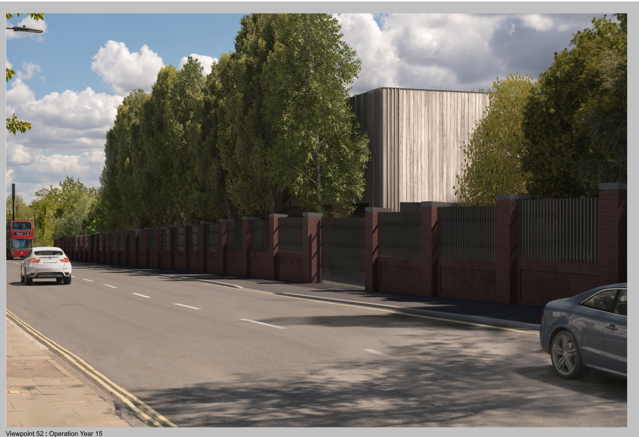
Viewpoint 52 : Operation Year: 15