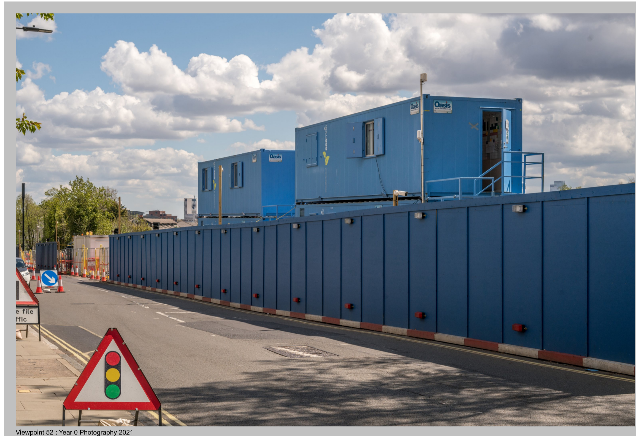
Viewpoint 52 : Year 0 Photography 2021 Photography taken from pedestrian view