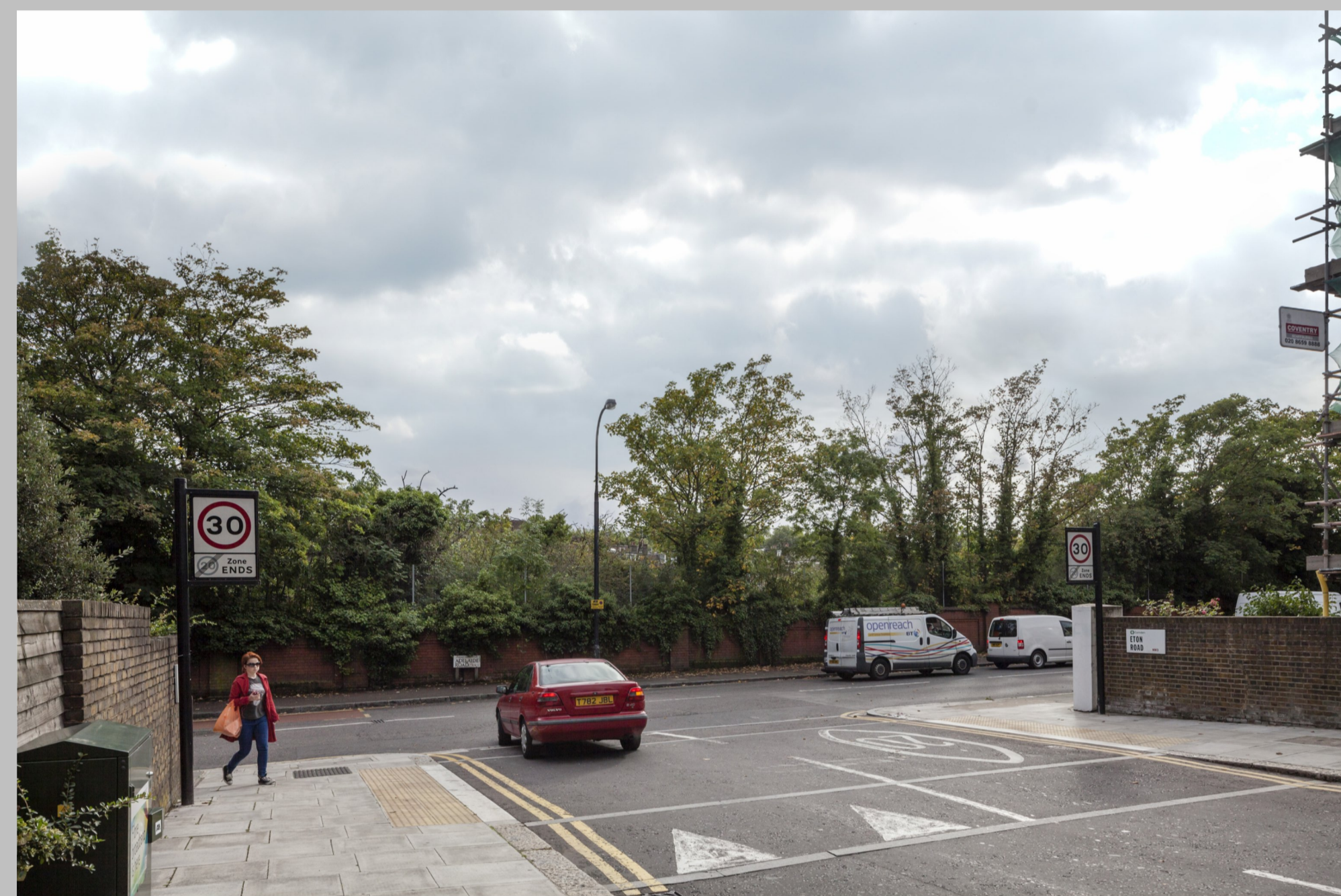
Viewpoint 51 : Baseline Photography - 2012