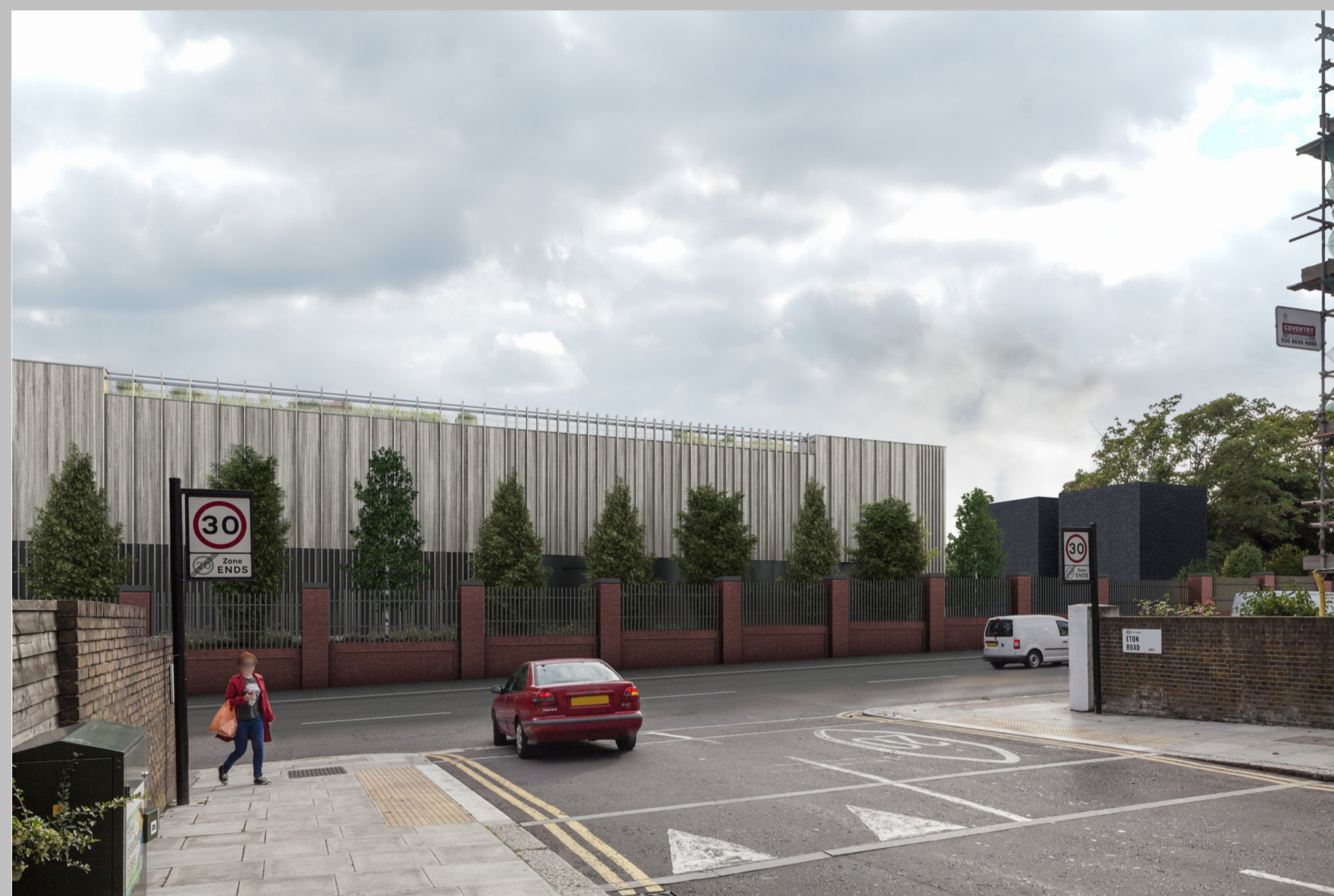
Viewpoint 51 : Operation Year 1