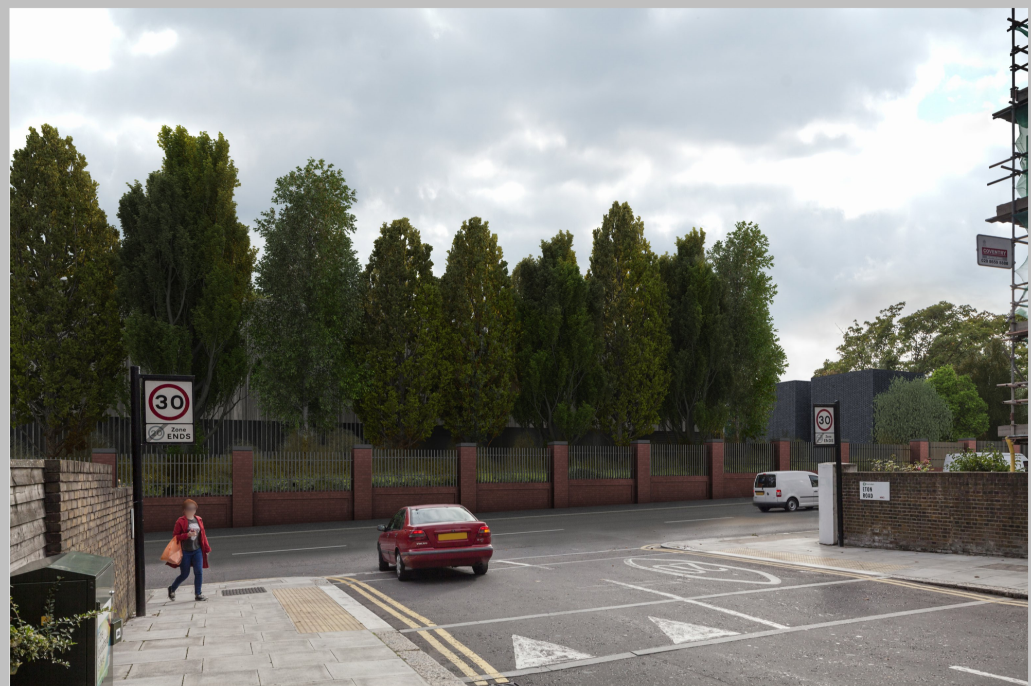
Viewpoint 51 : Operation Year 15