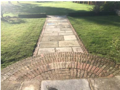
Reclaimed York paving to new patio areas