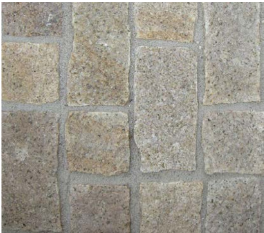
Driveway crossover: Granite setts - 50% 200 x 100 x 100mm, 50% 100 x 100 x 100mm