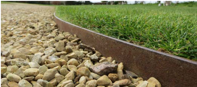
Path and driveway edging: 5 x 100mm mild steel estate edging –