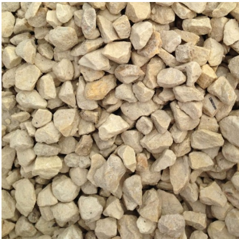
Gravel: Cotswold chippings - 20mm