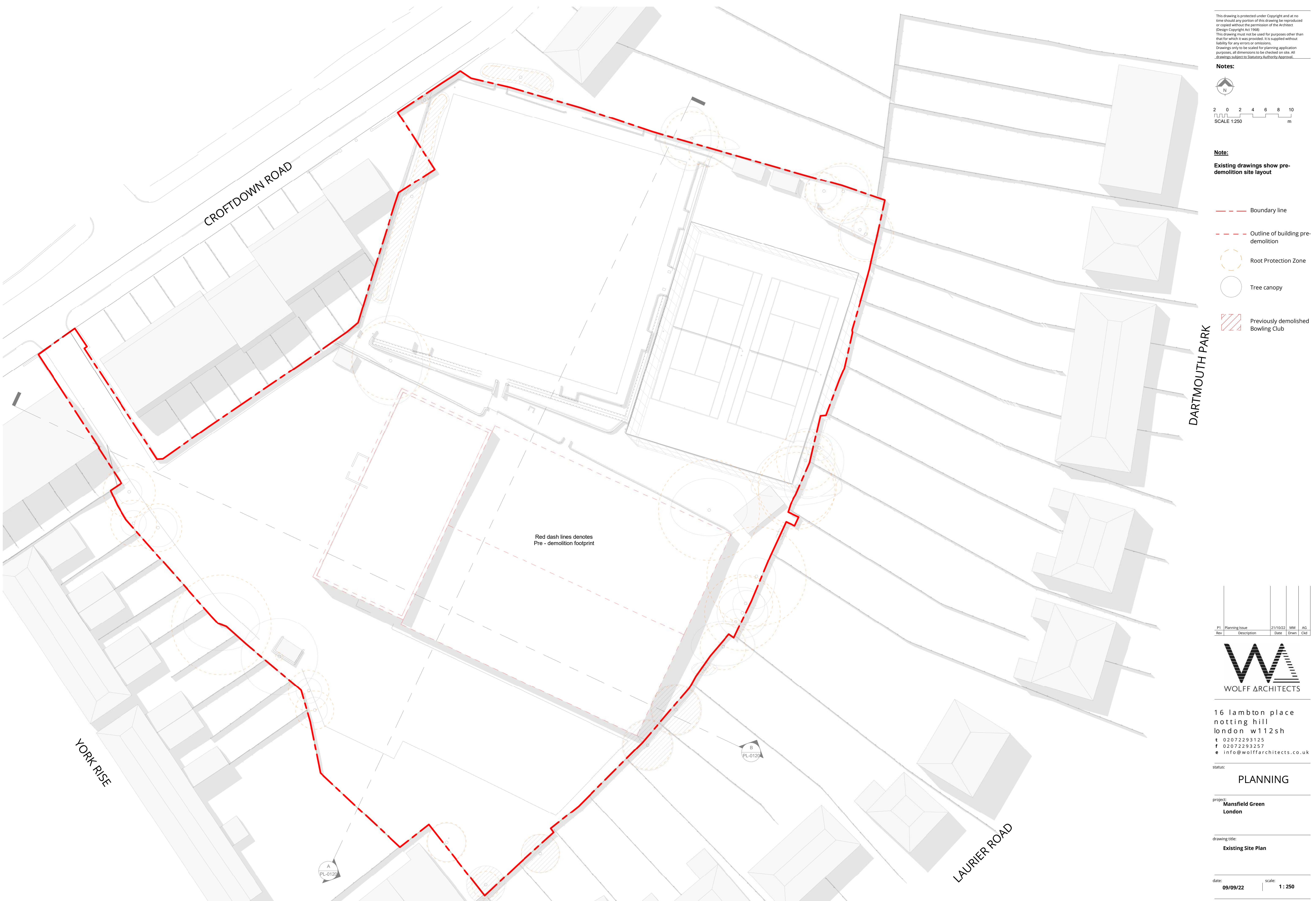
Existing Site Plan 1 : 250

This drawing is protected under Copyright and at no time should any portion of this drawing be reproduced or copied without the permission of the Architect (Design Copyright Act 1968) This drawing must not be used for purposes other than that for which it was provided. It is supplied without liability for any errors or omissions. Drawings only to be scaled for planning application purposes, all dimensions to be checked on site. All drawings subject to Statutory Authority Approval.